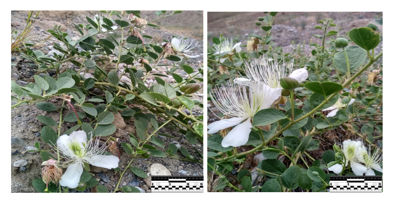
Figure 2. The plant C. spinosa L. growing in the experimental area (Scale: 1:50).

A study of the C. spinosa L cenopopulation and its conditions of existence in the dry subtropics of southern Uzbekistan was carried out. Pictures of vegetative C. spinosa L. are giver on Figure 2. For the first time, the complex characteristic of soils of automorphous and semi-hydromorphous positions of relief was given. Soil properties and biogeochemical parameters of ecosystems were characterized. The connection between the chemical composition of soils and the biochemical composition of various parts of studied plants was revealed.