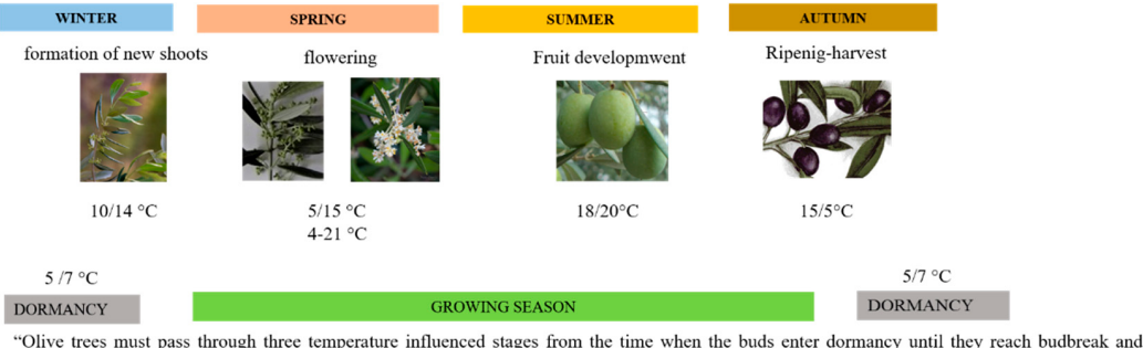
"Olive trees must pass through three temperature influenced stages from the time when the buds enter domancy until they reach budbreak and flowering: (1) endodormancy, during which chilling occurs; (2) ecodormancy, when buds have accumulated enough cold, but the temperature is too low for budbreak; and, (3) a period of heat accumulation (Rallo and Martin, 1991)"

For the environmental conditions, olive is considered one of the most suitable and best adapted species to the Mediterranean-type climate, characterized by mild and humid winters, with minimum temperatures of about -4 °C, and hot and dry summers, with maximum temperatures of about 50 °C; and most of the rainfalls concentrated in the cold season. [16,18–20]. Under the climate conditions of Mediterranean region, the vegetative-reproductive cycle is biennial in which production and induction of flower buds coexist at the same time, on the growing shoot, for fruiting the following year [13,21–25] (Figure 1).