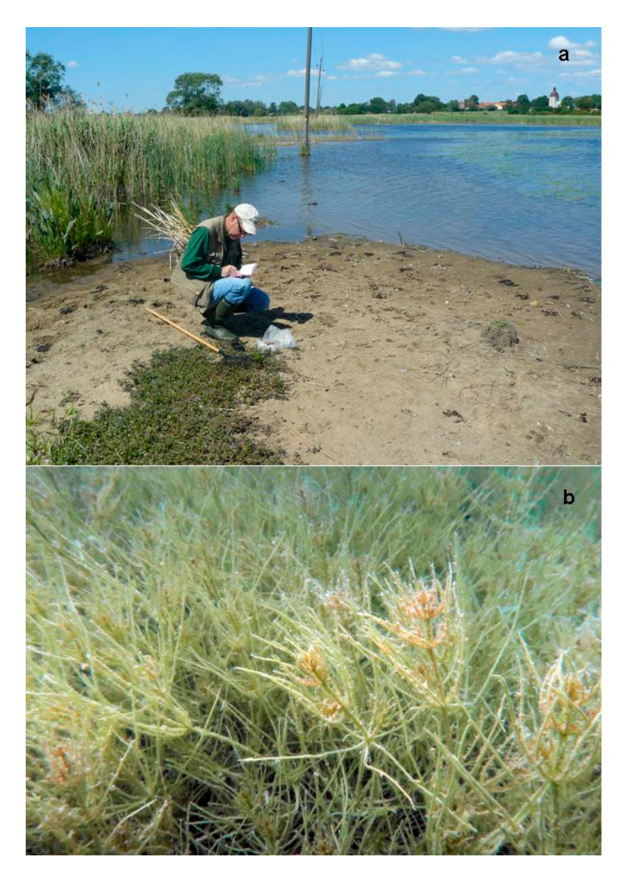
Figure 2. Different life strategies in charophytes: ( a ) Nitella capillaris , an extreme R-strategist, was re-discovered in this small water body near Kristianstad, about 100 years after the last record in the country. ( b ) The K-strategists Chara subspinosa and C. tomentosa form dense vegetation in Lake Levrasjön.