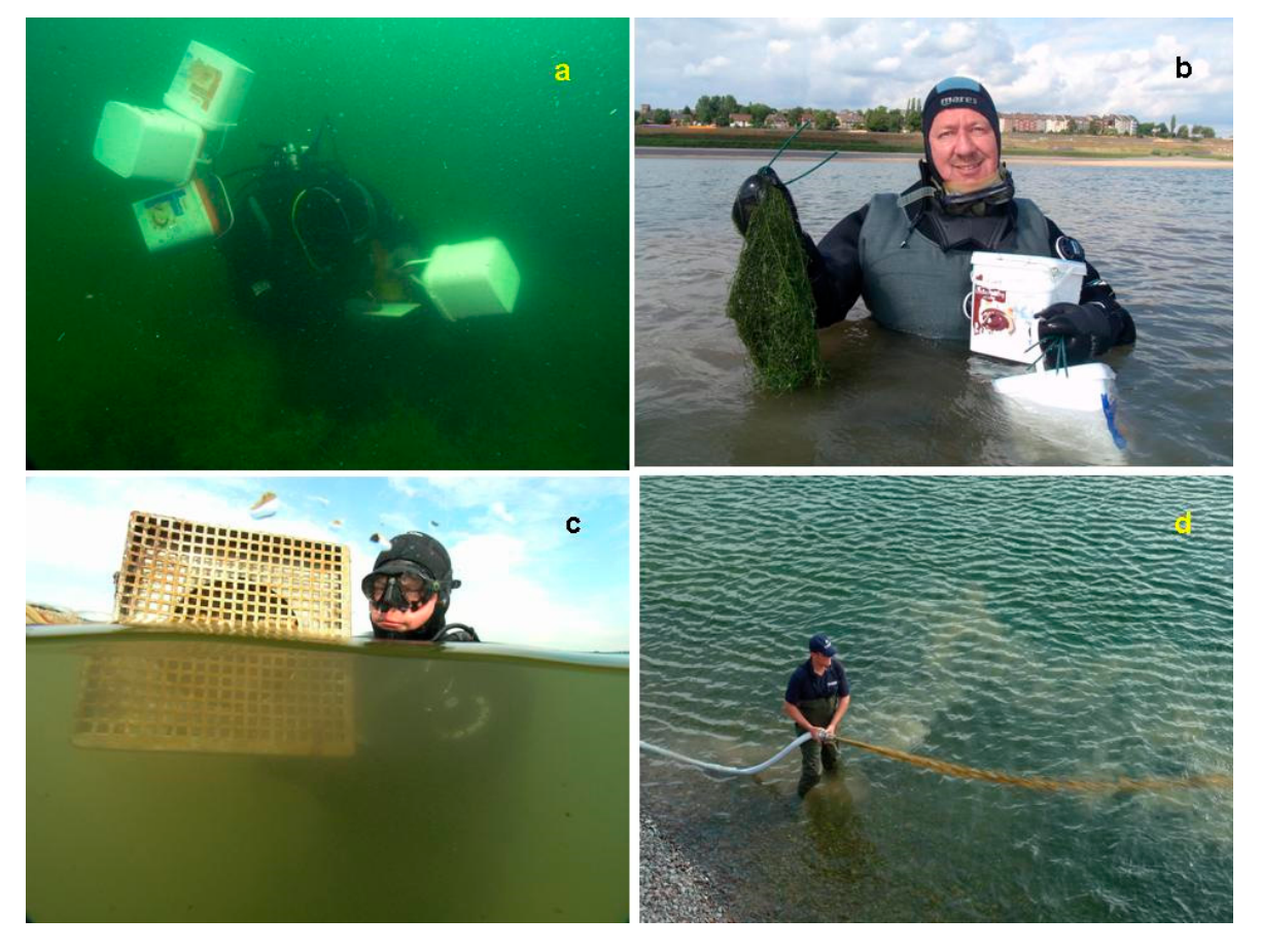
Figure 5. Lake Phoenix, Germany. ( a ): charophytes (green plants) are collected by divers in the donor lake, ( b ): planting of charophytes in L. Phoenix, ( c ): collection of water and sediment containing oospores by divers using a pump in the donor lake, ( d ): implementation of donor lake water and sediment in L. Phoenix.