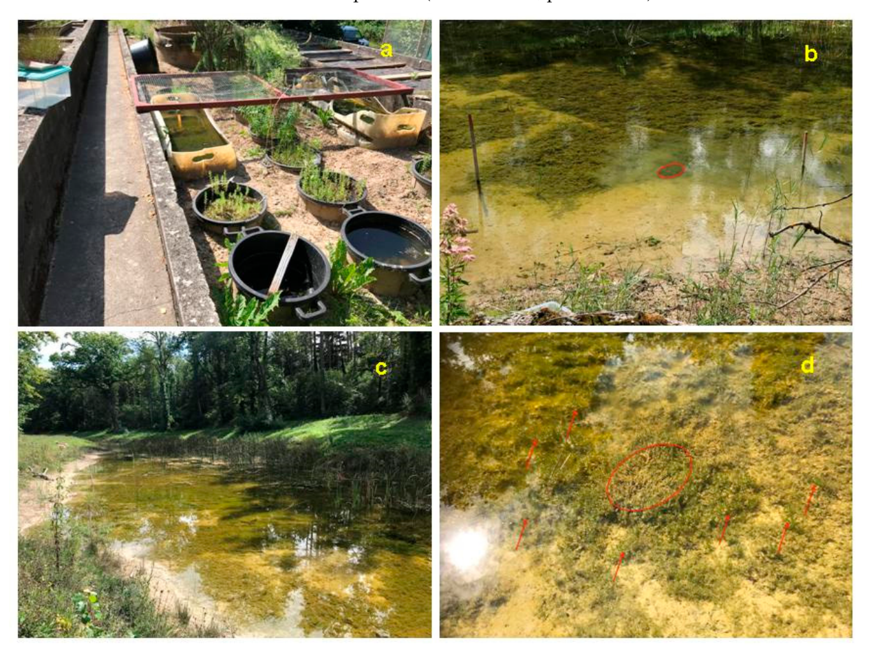
Figure 6. Transplantation of Nitella hyalina in Switzerland. (a) Precultivation in different tanks in a garden. (b) Target site during 2019. Transplanted N. hyalina (red circle) within vegetation consisting of different Chara species. (c,d) Target site during 2020. (d) Some N. hyalina had hibernated (red circle); establishment of N. hyalina outside of the original plantation is indicated by red arrows.

According to our knowledge, the Swiss action plan for Nitella hyalina was the first time a threatened charophyte species was planted aiming to re-establish the species in its (former) Swiss distribution area (Schwarzer 2017 [111]). Fresh plant material was collected in France during 2017 and pre-cultured outdoors. These pre-cultures were successful. The plants hibernated and produced richly fertile biomass during 2018, when Nitella hyalina was planted in suitable sites close to Lake Zürich. During the following years, the species was stable in six out of 10 sites and expanded in these sites (see Figure 6). Plantations in additional sites are planned (A. Schwarzer, pers. comm.).