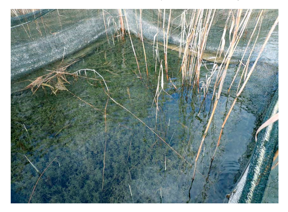
Figure 4. Dense charophyte vegetation ( Chara subspinosa, C. tomentosa ) inside grazing protections, Lake Wucker, Germany.

unsuitable conditions such as strong currents, unconsolidated sediments, and low light availability. Sediments also should have a sufficiently high share of organic material and may not contain toxic substances. Protection against grazing is especially important as long as plant biomasses and expansion on the target site are low (Lauridsen et al., 1993 [94], Irfannulah and Moss 2004 [93], Hilt et al., 2006 [80], Moore et al., 2010 [141], Jeppesen et al., 2017 [77], Rohal et al., 2021 [142], van de Weyer et al., 2021 [83]; Figure 4).