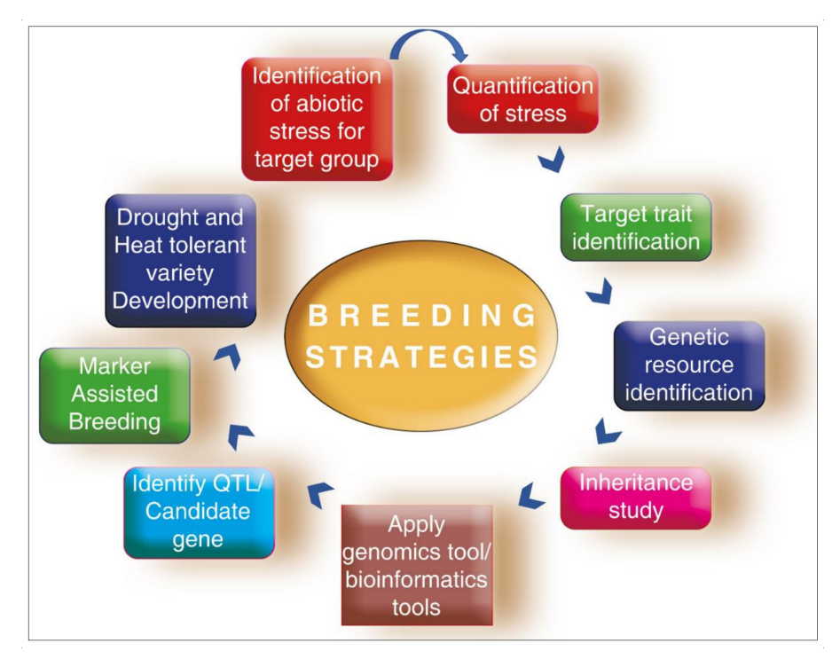
Figure 1. Breeding strategies deployed for cool-season legume breeding.