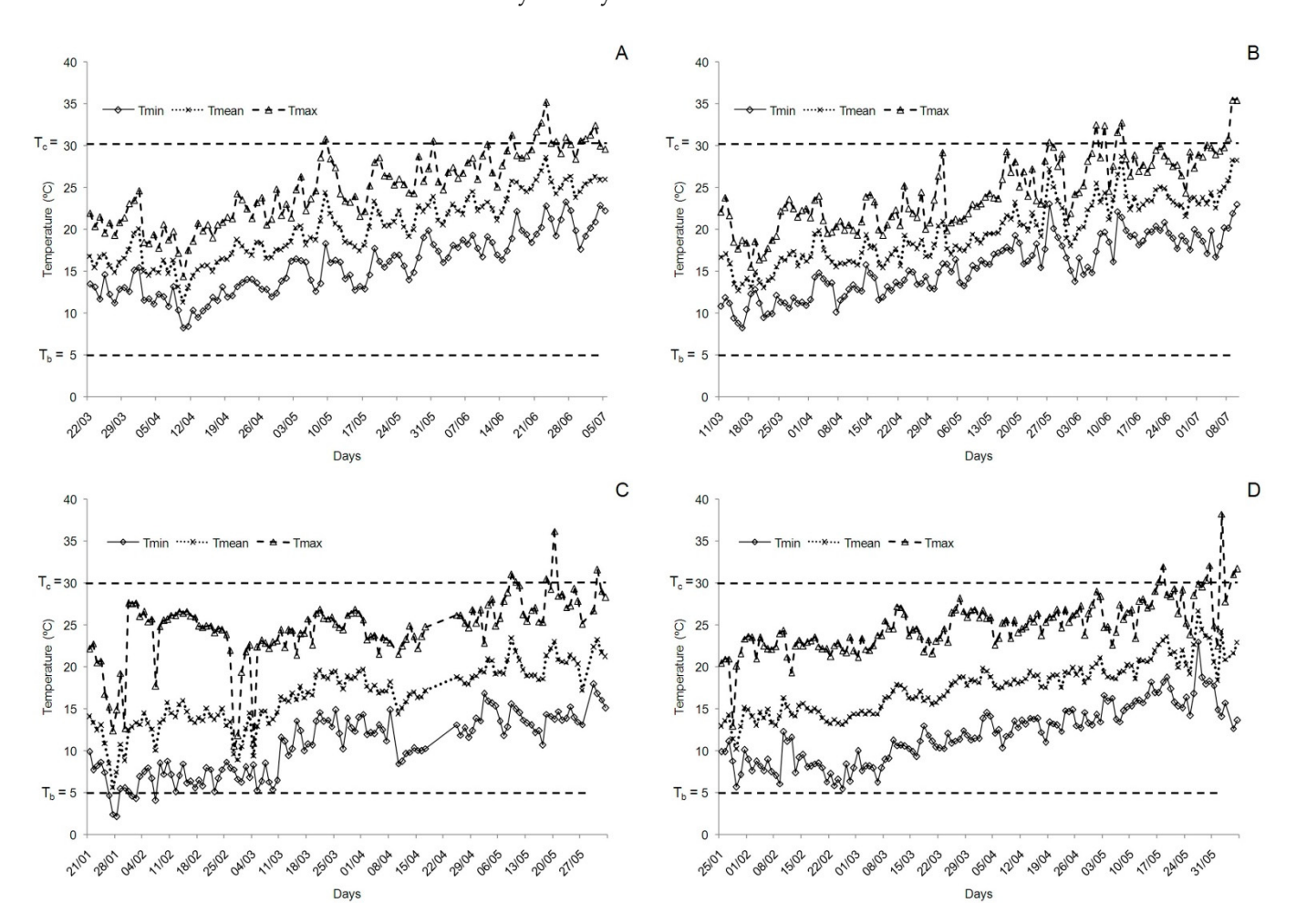
Figure 2. Minimum, mean and maximum daily temperatures during the coolest season (2005) and the warmest season (2006) in the open field ( A and B , respectively) and inside the plastic greenhouse ( C and D , respectively).

harvest date with a reasonable exactitude in both environments. The ability of the procedure based on heat unit requirements using the average year was found quite satisfactory. In the season 2009, the procedure predicted the beginning of harvest on 12 July 2009, while the berries reached the maturation index established for harvesting at 16 July 2009; that is, four days later than predicted. If we used the typical meteorological year instead of the average year, then the prediction ability was greatly improved since harvest was forecast at 15 July 2009; that is only one day before harvesting. The method of adding calendar days from 2009 bud break date to ripening was again less reliable, miscalculating harvest commencement by six days.