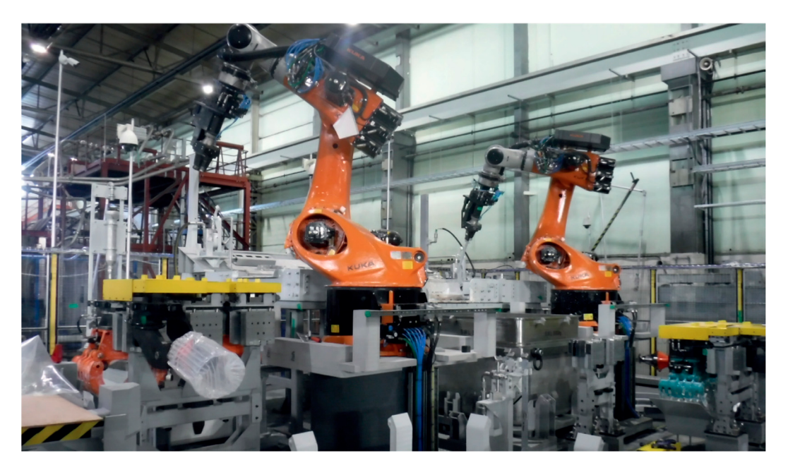
Figure 1. Box Encapsulation Plant (BEP) robot rig trial being carried out at National Nuclear Laboratory (NNL)'s rig hall in Workington, Cumbria, UK.

In 2018, full-scale trials of a robotic waste handling plant for use in the Box Encapsulation Plant (BEP) on the Sellafield site (see Figure 1) were conducted. The project took commercially available industrial heavy foundry robots and developed a cell that could sort, size-reduce, and repack waste for efficient long-term storage. The robots used standard industrial tools, such as shears and grabs. The trials took the project from TRL level 3 to 6 and replicated the proposed design for use on site for the repacking of legacy waste. As a result of the trials, many enhancements were developed such as semi-automated housekeeping routines that will save considerable amounts of time when deployed [21]. The non-active test rig allowed the developers to refine the process and program code the robots were using, while independent assessment ensured the end user had confidence the system would perform as expected. This is an example of existing proven technology, the industrial robots, being applied in an application that had not been done before. This was the first time industrial robots were used for waste processing in this way.