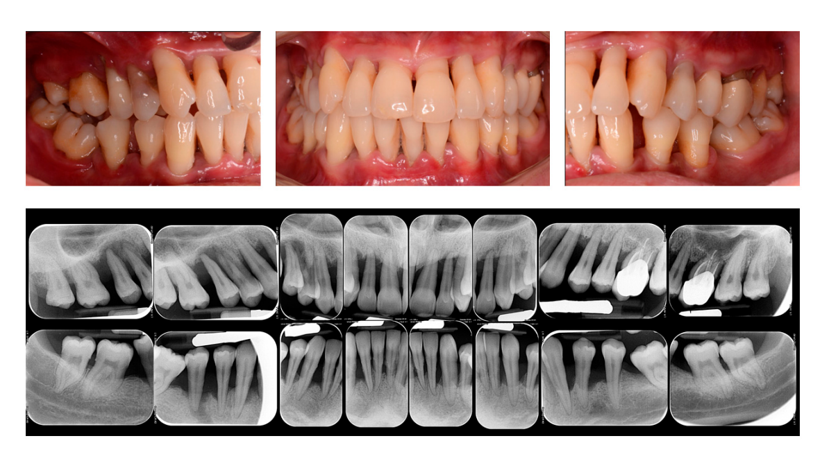
Figure 1. Clinical and Rx images of a patient with periodontitis.

The classic approach to periodontal disease may well change in the future. In fact, over the last few years, the concept of personalised dentistry has become increasingly popular, thanks to a broader knowledge of the characteristics of the oral microbiome and proteome. This has been made possible by the increased awareness that saliva and the crevicular fluid (GCF) represent an inexhaustible source of information, so the application of various "OMIC" approaches has made it possible to obtain information on the composition of the oral microbiome, the salivary proteome and the functional profile of the innate immune response. Despite the large amount of information obtained and the development of relevant microbial and biochemical information databases, this has not translated into new strategies for diagnosis, treatment, and follow-up, as there is a need for further longitudinal studies. This can only be achieved through meaningful and routine screening of changes in the microbiome, proteome or metabolome in health and disease, through the pointof-care (POC) technique. It is a minimally invasive and rapid technique that includes small-scale laboratory molecular assays integrated on a cartridge that could be performed during routine visits, yielding a wealth of information useful for the development of targeted therapies [31].