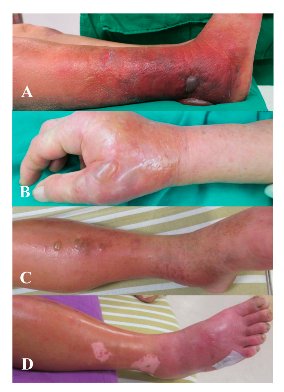
Figure 3. Skin lesions in patients with Gram-positive necrotizing fasciitis. ( A ) A 70 year-old female with MRSA infection revealed to have lower right leg hemorrhagic bullae lesions. ( B ) A 77 year-old female with Streptococcus dysgalactiae in wound culture of left hand revealed to have nonhemorrhagic bullae lesions. ( C ) A 54 year-old male with MSSA infection presented with nonhemorrhagic bullae on lower left leg. ( D ) A 59 year-old male with Corynebacterium infection revealed to have lower right leg nonhemorrhagic bullae lesions.