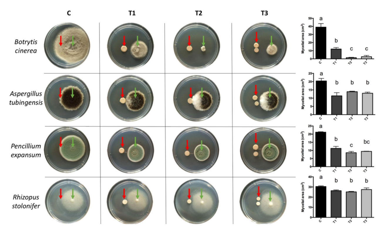
Figure 1. Dual cultures of BCAs (red arrows) with pathogens (green arrows). For all pathogens, an inoculum of 20 \mu L was used at a concentration of 1 × 10<sup>5</sup> conidia mL<sup>-1</sup>. The concentration for G. cerinus was 1 × 10<sup>6</sup> CFU mL<sup>-1</sup> and 1 × 10<sup>4</sup> cells mL<sup>-1</sup> for H. osmophila . (C) Control: 20 \mu L of sterile distilled water, (T1) 20 \mu L of G. cerinus , (T2) 20 \mu L of H. osmophila , and (T3) 10 \mu L of G. cerinus and 10 \mu L of H. osmophila . Vertical bars represent standard deviation and different letters indicate significant differences according to Tukey's test ( p < 0.05).

present several advantages compared to other microorganisms [30,31]. However, a deep understanding of the action mechanism is required to develop appropriate formulation and application methods [24].