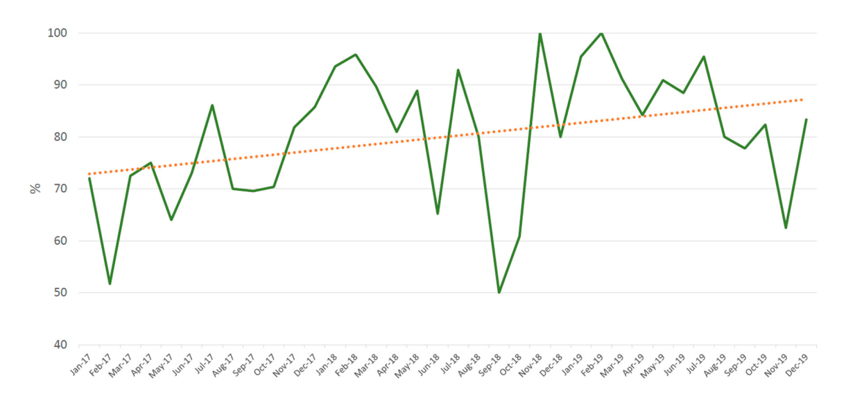
Figure 1. Percentage of optimal prescriptions during the postintervention period (2017–2019) in patients admitted due to appendix-related intraabdominal infections (AR-IAIs). Overall, 715 prescriptions were evaluated and a trend towards an improvement was observed (p = 0.052).