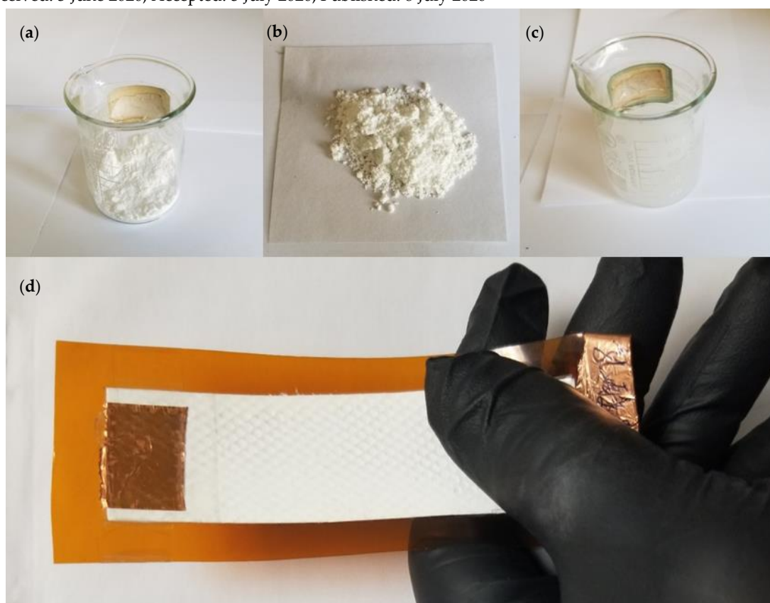
Figure S1. Optical photographs of self-powered biosensor. (a) PVDF (b) T-ZnO (c) T-ZnO/PVDF paste (d) self-powered device.

Received: 3 June 2020; Accepted: 3 July 2020; Published: 8 July 2020