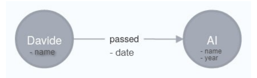
Figure 1. LPG representation of two nodes and a relationship with attributes.

We also provide a graphical representation of how concepts are mapped in the two different graphs. We provide the JSON code associated with a relationship between two nodes. Each concept also has properties as shown in Table 6. For the sake of simplicity, but without losing generality, we just have a student, an exam, and a relationship stating that the student passed that exam. In Figure 1, the LPG representation is shown. The mapped RDF graph is shown in Figure 2 after applying all the mappings described in the table.