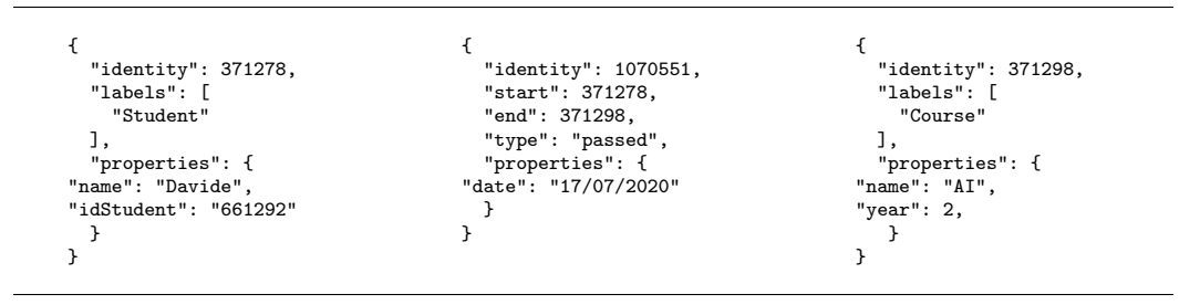
Table 7. Translations from data in the LPG graph to data in the SW [164].