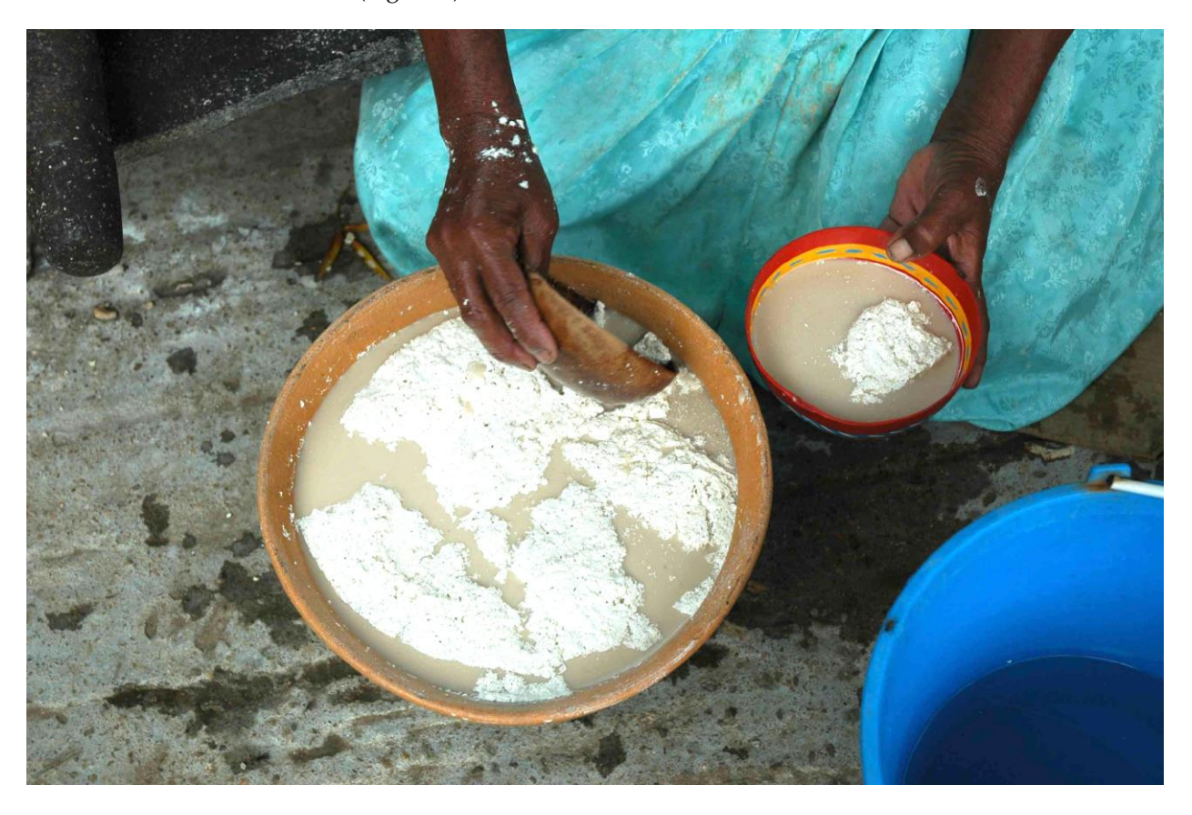
Figure 1. Serving tejate into a jícara .

Tejate preparation is labor- and skill-intensive. Today, women (exclusively in our experience and in published sources) in Zapotec CV communities prepare tejate using maize nixtamalized with wood ashes ( cuanextle ), and a toasted and ground mixture of cacao rojo ( Theobroma cacao L.), rosita de cacao blossoms ( Quararibea funebris (La Llave) Vischer (Bombacea)), mamey seed or pixtle ( Pouteria sapota (Jacq.) H.E. Moore & Stearn), and, in some areas, cacao blanco ( T. bicolor Humb. & Bonpl.), cocoyul ( Acrocomia aculeata (Jacq.) Lodd. ex Mart.), or other more widely known ingredients such as coconut, peanut, or walnut [33]. Tejate is served in a jícara , a decorated, bowl-shaped vessel made from Crescentia cujete L. or C. alata (Figure 1).