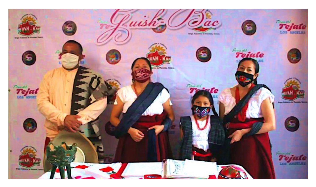
Figure 2. Representatives of the Grupo Folklórico Guish-Bac announce the cancellation of the annual Feria del Tejate in September 2020 due to the coronavirus pandemic and thank past participants.

The CV have experienced high rates of labor migration to the US, including to California, which together with Oaxaca itself is sometimes referred to as Oaxacalifornia, a transnational geographic space and the support networks and values that sustain it [72,73]. In greater LA the large diaspora of CV Zapotecs is re-creating elements of their culture, including tejate and other traditional foods (Figure 2), in their new home, in spite of the skill and labor required, and difficulties in obtaining the traditional ingredients, including maize varieties.