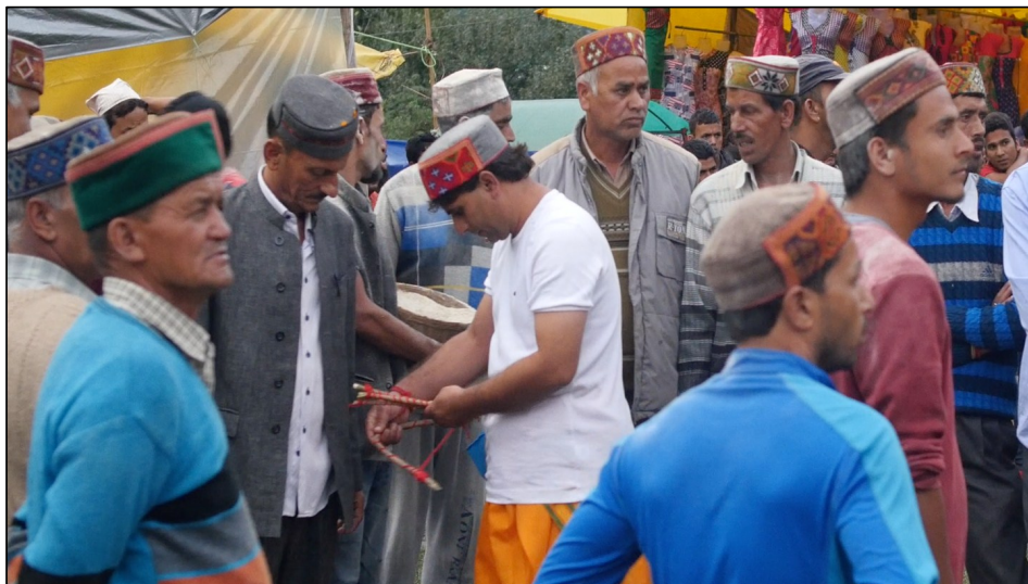
Figure 7. The kardar prepares to sacrifice ( Narbali ).