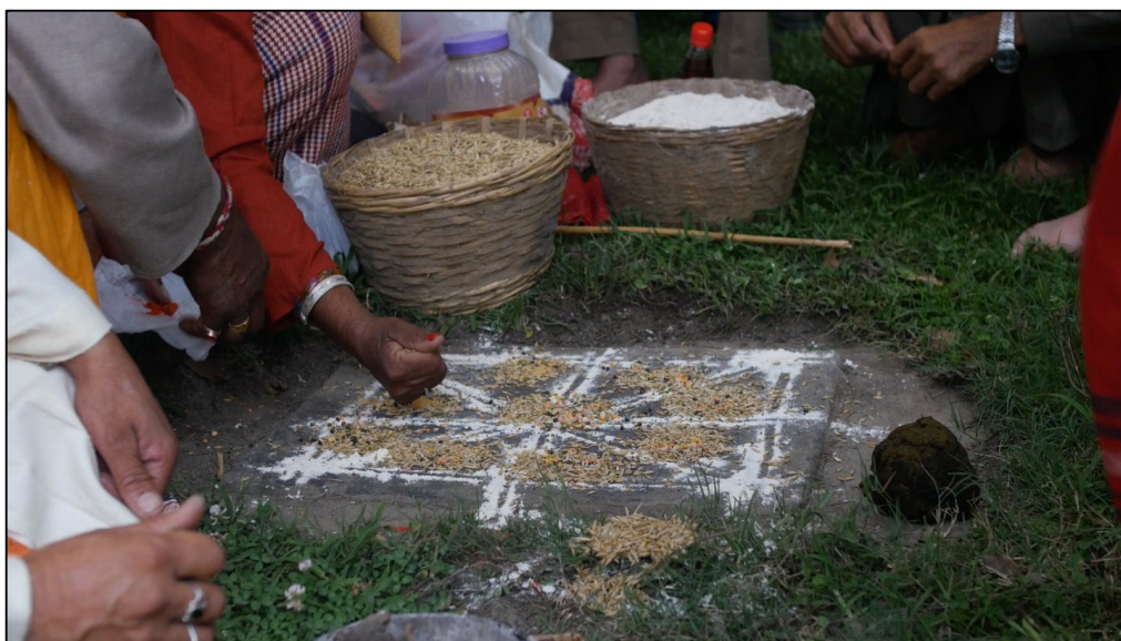
Figure 2. Empowering the yantra (Kahika Kharerna).

Having secreted the ḍāḍh from a plastic bag, the Nar wrapped it in white cloth and placed it at the centre of the ritual space above the square yantra. He then drew a replica of the base yantra on top of the device. Locked between these parallel, ritually empowered representations of the universe,