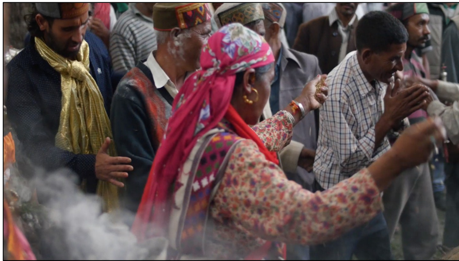
Figure 6. The Naran leading in dance towards the site of the killing ( Narbali ).