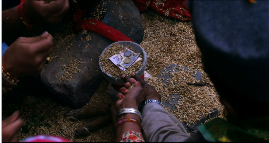
Figure 4. Chidra Yajna, casting grains on the dādh . Note the ritual specialist's physical contact with the 'cosmic trap'.

substances of numerous communities in the course of three, heavily charged days. By the end of the seventh and final round of chidra (Figure 5), his body has absorbed a critical mass that, as the law of karma dictates, was to be removed elsewhere in order for the rite to succeed. It was then that the infamous association of the Kahika Mela with human sacrifices came into play.