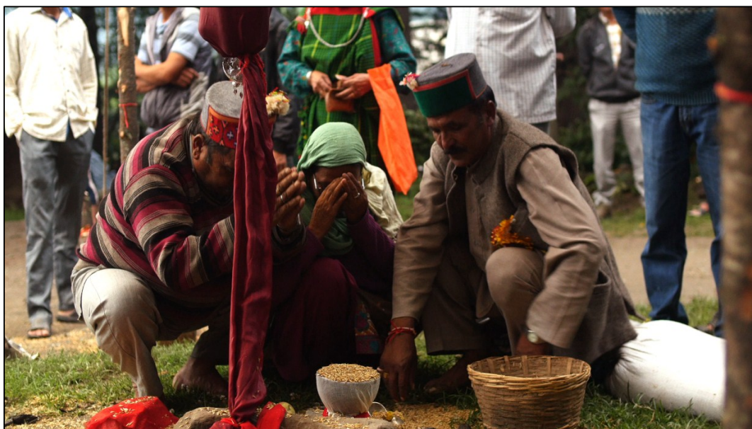
Figure 3. Private Chidra Yajna.

Throughout the numerous rounds of chidra yajnas , the Nar kept his left hand fingers on the ḍāḍh while casting grains on its surface with his right hand (Figure 4). By maintaining contact with the object of the participants' malignant karmas—or rather, the actions that bound them to aggrieved parties and their potentially perilous outcomes—the ritual specialist accrued the harmful, invisible