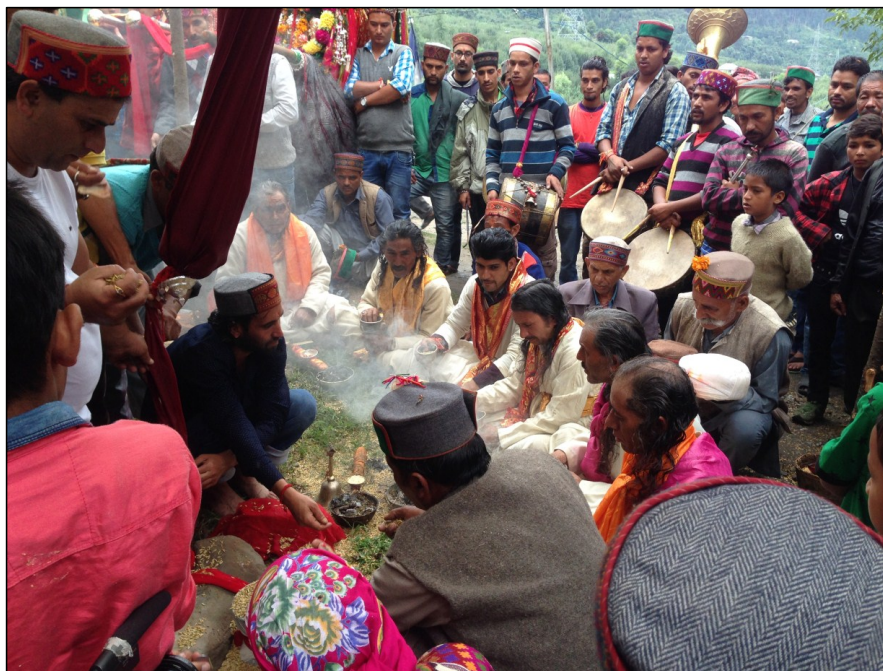
Figure 5. Final Round of Chidra Yajna. The mediums sit below the Nar, the deities chariots ( raths ) and followers in the background.