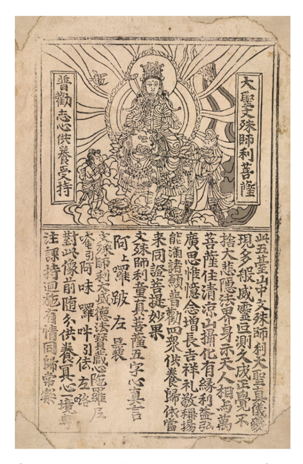
Figure 2. Image of the True Visage Mañjuśrī, woodblock print, Mogao Cave 17, Dunhuang, ca. 944–974. British Museum 1919, 0101, 0.238.