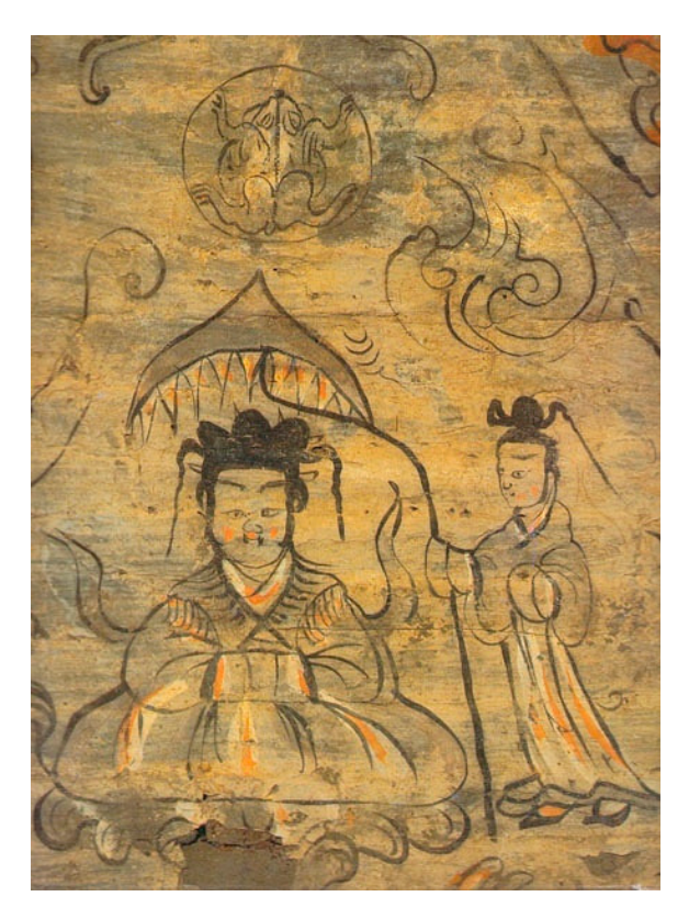
Figure 12. Image of the Queen Mother of the West, Dingjiazha Tomb, Jiuquan. Sixteen Kingdoms Period. Image from Huang and Meng (2021), Fig. 3.

Layered atop the kedangyi is the cloud collar. Widely known as a popular woman's accessory in the Ming and Qing dynasties, recent research has shown that in its early history, cloud collars were likely used as an accessory for divinities in the traditional Chinese pantheon. Many scholars have noted that from the Han (202 BCE–220 CE) to the Northern and the Southern Dynasties (420–589), traditional Chinese deities such as Fuxi and Nvwa, Queen Mother of the West and celestial beings are often depicted wearing a collar (Figure 12) (Li 2000, p. 46; Gao 2005; Huang and Meng 2021). This collar is not seen on mortals, suggesting it to be a symbol of the divine. Scholars further propose that the collar was derived from the imagery of winged or feathered beings, owing to the Chinese imagination of the divine as being able to mount the clouds and wander unchecked over the universe (Gao 2005).