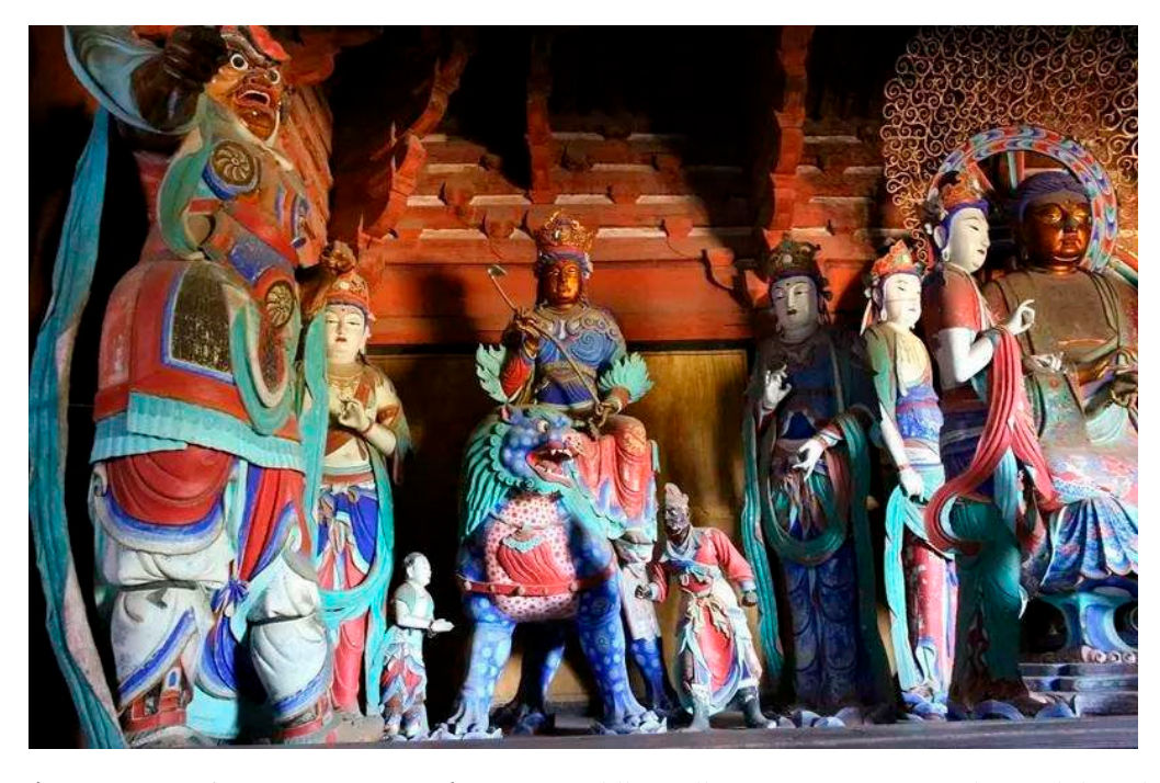
Figure 4. Icon of True Visage Mañjuśrī, Great Buddha Hall, Foguang Monastery, late eighth to the ninth century.