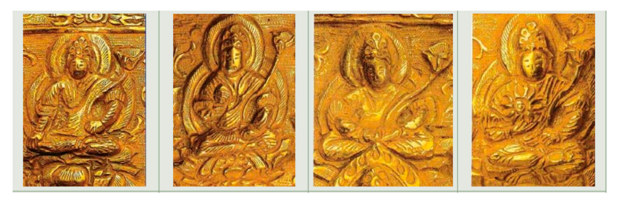
Figure 16. The four Prajñāpāramitās of vajradhātu on the lid of a gilt bronze container showing forty-five deities, 871, Famen Monastery. Image adapted from (Lai 2009, Table 1).

both in anthropomorphized form and in a kedangyi . In any case, the late eighth and ninth century is definitively later than the formulation of the True Visage Mañjuśrī.