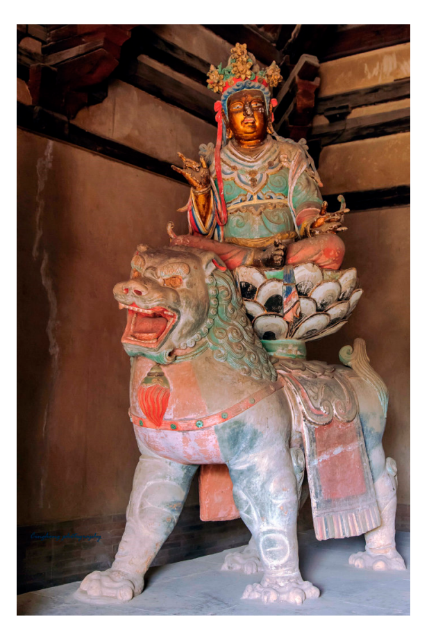
Figure 3. Icon of True Visage Mañjuśrī, Nanchan Monastery, Mount Wutai, 782.