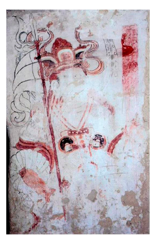
Figure 10. Detail of the mural on the north wall of the corridor of Mogao Cave 103 showing Vaiśravaṇa, Dunhuang, eighth century.

patterns around the elbows (Figure 11). Given the textual and pictorial evidence, it seems that the shirt worn by Mañjuśr \bar{\imath} is also a kedangyi/liangdangyi , a garment that was part of the standard dress of Chinese warriors and noble elites.