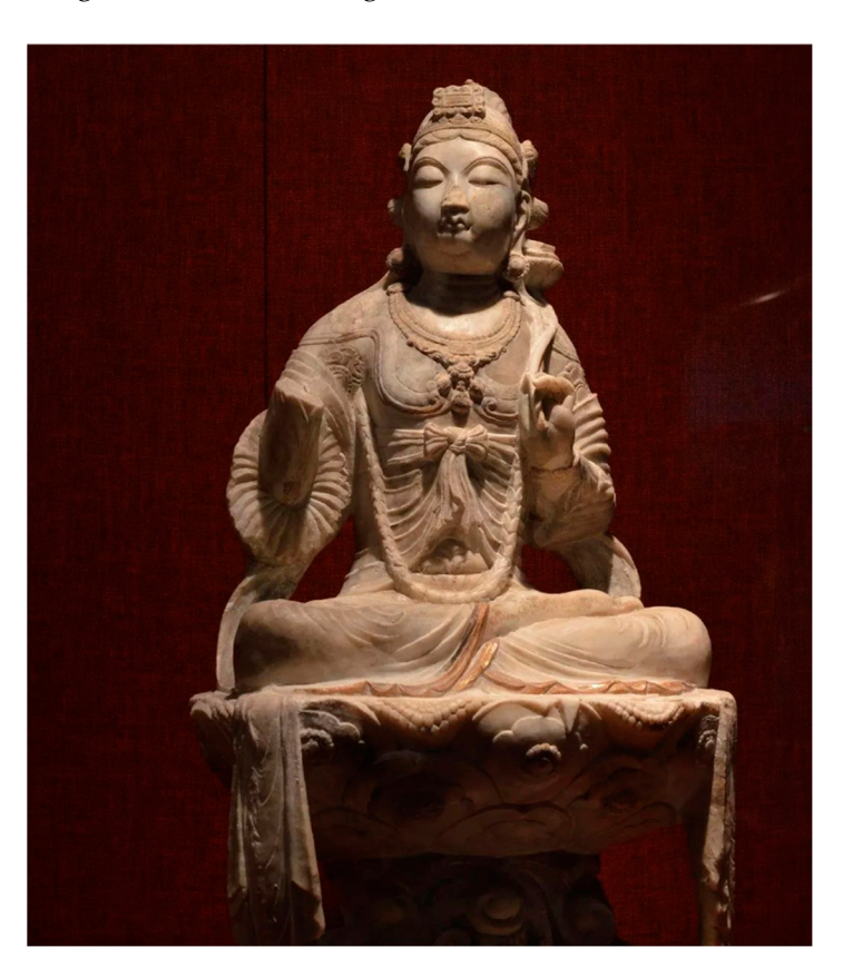
Figure 17. Marble statue of Mañjuśrī, mid-eighth to early ninth century. Beilin Museum, Xi'an.

in the future may bring renewed thinking to the cult of Mañjuśrī and contribute to a more fine-grained understanding of Chinese Buddhist art.