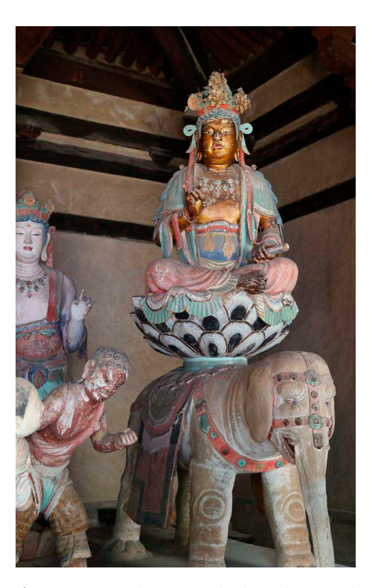
Figure 7. Icon of Samantabhadra riding an elephant, Nanchan Monastery, Mount Wutai, 782. The attendants are seen to the left of Samantabhadra.