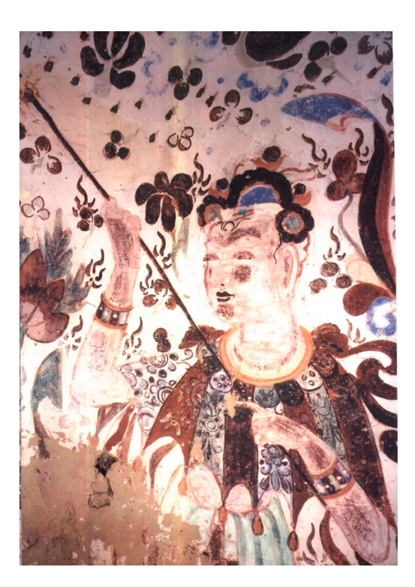
Figure 13. Mogao Cave 62, Sui.

Past studies on the two clothing pieces reveal their Chinese origination and sacred cultural association. We can understand that the implied sacredness of the cloud collar would add to the transcendent aura of Mañjuśrī, while the visual pomp and ritual association of the kedangyi may serve to glorify the bodhisattva. Yet, it is still insufficient to fully elucidate important questions such as who decided on this fashion change as well as its deeper levels of significance in a new representation of Mañjuśrī claiming an unprecedented level of authenticity. Although it is difficult to answer these questions with certainty due to limited sources, the next section makes some preliminary suggestions that may at least point to the complex mechanism and dynamics involved in the formulation of the True Visage Mañjuśrī and the cult of Mount Wutai.