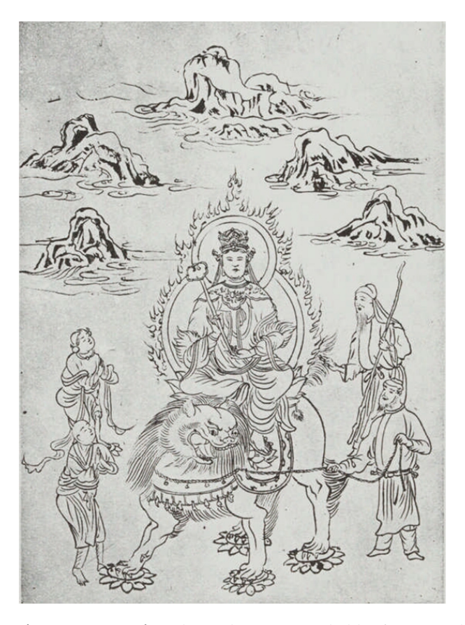
Figure 8. Mañjuśrī riding a lion surrounded by four attendants with Five Sacred Peaks of Mount Wutai in the background. Woodcut print, 12th century. Image from Nishikawa et al. (2001), Daigoji taikan, vol. 2, 113.