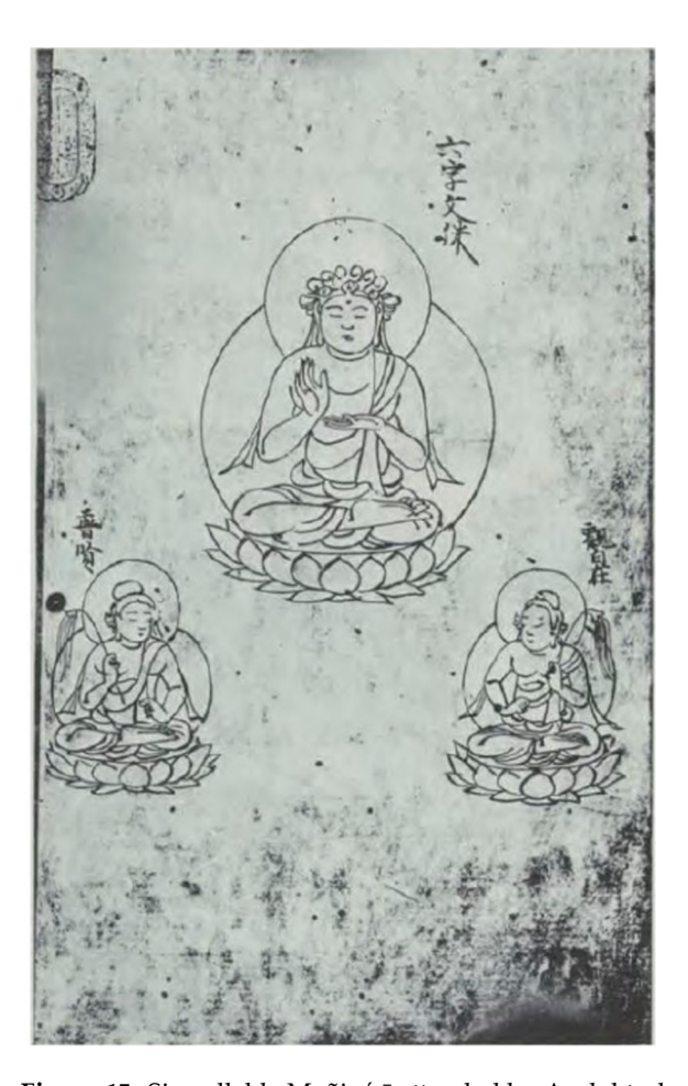
Figure 15. Six-syllable Mañjuśrī attended by Acalokteshvara and Samantabhadra.

As it is safe to conclude that the Wutai images discussed in this paper transmit the original True Visage image of Mañjuśrī developed at the Great Huayan Monastery, we can then evaluate whether the incorporation of the special dress ensemble to the True Visage Mañjuśrī referenced any esoteric connection. Historically, the Great Huayan Monastery was not an esoteric site; hence, we are missing the rationale for it to adopt any esoteric iconography. Chronologically, the creation legend of the True Visage Mañjuśrī places the event in the Jingyun era (710–712), which is decades earlier than the introduction of Tang esoteric Buddhism in the latter half of the Kaiyuan era (713–741). If the date in the Jingyun era is reliable, then the formulation of the True Visage Mañjuśrī was earlier than the flowering of esoteric Buddhist philosophy and art, precluding the possibility that the fashion detail's incorporation into the True Visage Mañjuśrī had any esoteric connection. Unfortunately, the historical accuracy of the Jingyun era cannot be fully confirmed as it is recorded only in tenth- and eleventh-century accounts, leaving it possible for the date to have been a fictive embellishment added in retrospect.