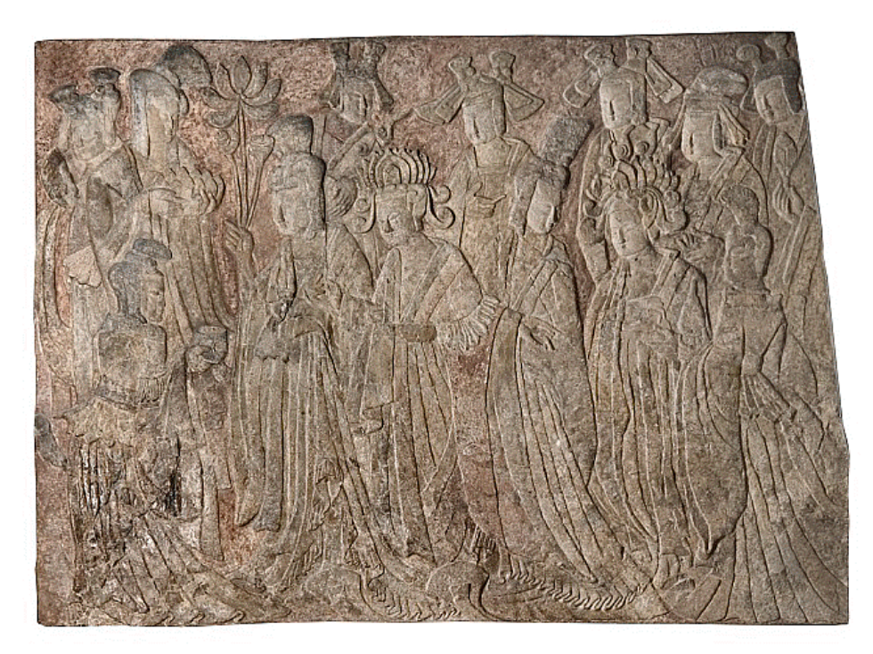
Figure 9. Offering procession of the empress as a donor with her court, Longmen Grottoes, ca. 522. The Nelson-Atkins Museum of Art.

The most visually intriguing aspect of the special ensemble is the shirt, with its flame-like sleeve details. Some scholars suggest that it may have been a kedangyi (a shirt covering the chest and the back, (衤蓋)檔衣) based on the notes accompanying deity images wearing a similar shirt and elbow details in medieval Japanese manuals for Buddhist rituals. Although the Japanese manuals do not provide further explanations about the kedangyi , references to liangdangyi (a variant name of kedangyi , 两襠衣) are found in Chinese sources, which explain it as traditional Chinese attire first developed in the Northern and Southern Dynasties (420–589) to be worn under armor or directly as a top in ritual occasions by aristocrats (Chen 2012, pp. 19–34). Archaeological materials supplement the textual explanation, as we observe that Empress Wenzhao, consort of Emperor Xiaowen of the Northern Wei dynasty (467–499), wore a shirt with just such elbow details (though rendered more petal- than flame-like) in a Buddhist offering procession as depicted in the center of the relief panel from the Longmen Grottoes, Henan (Figure 9).