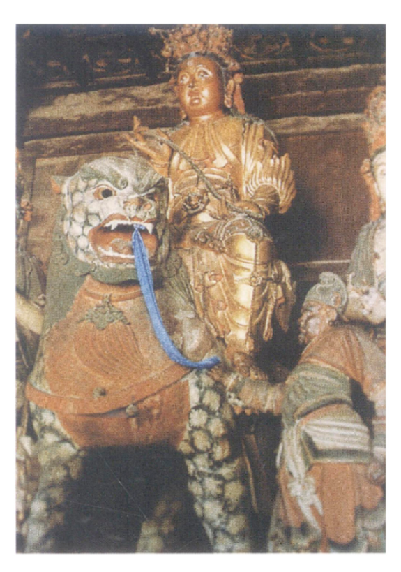
Figure 5. Icon of True Visage Mañjuśrī, Hall of Mañjuśrī, Foguang Monastery, 1137.