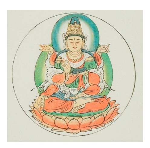
Figure 14. Prajñāpāramitā, scroll from the Compendium of Iconographic Drawings (Zuzōshō).

tion to build the Jin'ge Monastery at Mount Wutai and to install an image of Mañjuśrī at every monastery in the empire. <sup>34</sup>