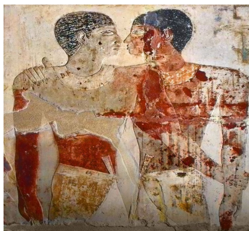
Figure 1. Dating from the Fifth Dynasty, the Nyankh-khnum and Khnum-hotep's epigraph reads: 'Joined in life and joined in death'. The presence of their wives and off-spring in certain panels among the glyphs has led some Egyptologists to assume they were siblings. However, repeated depictions of the two men embracing have convinced many Egyptologists that their intimate relationship might have been accepted by their respective wives. One thing is certain: the tomb depicts two men in a manner usually reserved for husband and wife, whilst there were no romantic depictions of their wives with them on the walls of the tomb itself. This argument is strengthened by the position of Khnum-hotep in many of these scenes, placing him in a position normally reserved for women, such as one scene in which he is shown smelling a lotus. Further reading: Reeder (2000), "Same-sex desire, conjugal constructs, and the tomb of Niankhkhnum and Khnumhotep".

Verses Al-'Ankabūt (29:28) and Al-'A'rāf (7:80) further show that the abomination "none in the world ever committed before the Lut people" could be used as historical evidence to support the revisionist standpoint. These verses provide a plausible chronological evidence of homosexology in a historical context by explaining that the condemnation in the Qur'ān is for male-on-male coercive rape and domination rather than the condemnation of a mere same-sex relationship that is based on love and compassion. Historically, same-sex unions occurred across the globe long before Prophet Lut's time (c. 1861 or 1761–1687 BCE), as they were thoroughly recorded in ancient Sumeria (c. 4100–1750 BCE), Mesopotamia (c. 3500–530 BCE) and Egypt (c. 3100–48 BCE). In Ancient Egypt, homoeroticism was recorded as early as 2800 BCE, where homosexual relations were common and often extended to a form of marriage (Parkinson 1995). The best-known case of a possible homoerotic relationship is shown in the tomb inscription of pharaoh Niuserre's chief manicurists, Nyankh-khnum and Khnum-hotep. Archaeologists found several paintings depicting both men embracing each other and touching each other nose-on-nose, representing a kiss. (see Figure 1).