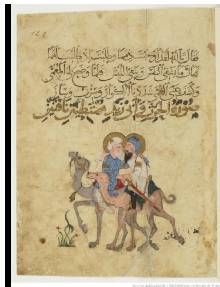
Figure 4. Illustration from the 13th century manuscript Arabe 3929; an assembly of stories in a poetic form, known as the Maqamat by Al-Hariri (1054–1122) of Basra (southern Iraq), produced under the late Abbasid caliphate. The manuscript features 99 surviving miniatures highly esteemed, in modern times, for their authentic depiction of the 13th-century Muslim life. In this image, Abu Zayd and al-Harith are riding their camels while holding each other by the shoulder and hand, face to face or, perhaps more accurately, mouth. There appears to be a heart-shaped figure around their heads. Societies in Islam have long recognised both erotic attraction and sexual behaviour between members of the same sex. See also ‘Orality, Writing and the Image in the Maqamat: Arabic Illustrated Books in Context’ ( George 2012, p. 31 ).