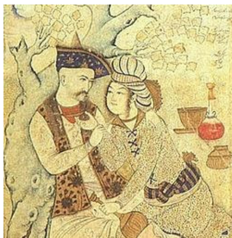
Figure 2. The illustration depicts Shah Abbas I of Persia and his page boy interacting and sharing wine, circa 1627. The imagery is soft and intimate as the page holds the wine flask erect towards the Shah’s crotch and almost embraces him.

In line with constructivism, I further agree with El-Rouayheb (2005) that the concept of homosexuality in pre-colonial and pre-modern Islam was based on active vs. passive roles and (platonic) passion for human beauty expressed in writing vs. lust pursued and that the Islamic jurists condemned the act of sodomy but tolerated homoerotic sentiments. Previously, the majority of the same-sex relationships were established mainly as a reflection of a hetero relationship as it was prevalent that the brides were younger than the husband. Furthermore, it was during the Abbāsīd period (752–1258), known as the Islamic Golden Age, 4 that the army from Khurāsān practiced homoeroticism widely under this dynasty (Bearman 2012). Likewise, the well-known book One Thousand and One Nights , compiled primarily during the Abbāsīd era, together with libertine poems of Abū Nuwās are among manuscripts that glorify same-sex promiscuous obscenity (Bearman 2012). Cross-dressing and gender-variant Muslims also lived freely and thrived as they performed at the Abbāsīd court, such as in the case of the ghulamīyyat , girls dressed as boys in an erotic fashion (Hamzic 2015). (see Figures 2–4).