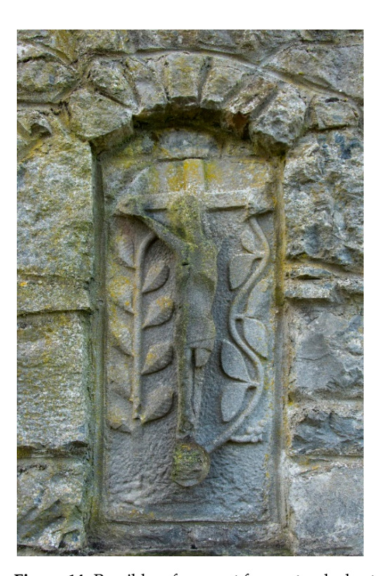
Figure 14. Possibly a fragment from a tomb chest, Church of the Nativity of the Blessed Virgin Mary, Kilcormac, Co. Offaly, sixteenth century.