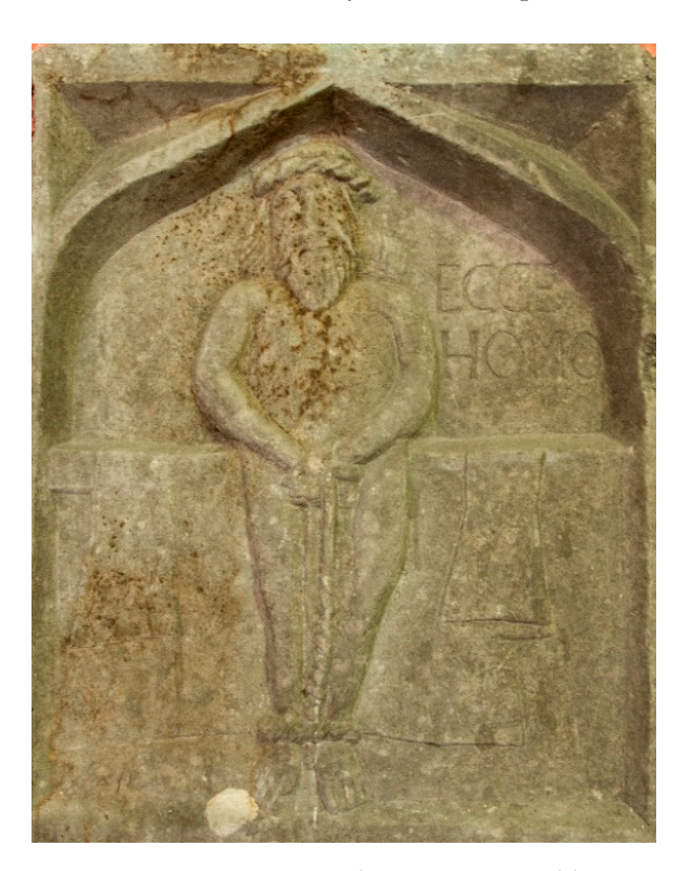
Figure 33. Ecce Homo, Carmelite Priory, Co. Kildare, sixteenth century.