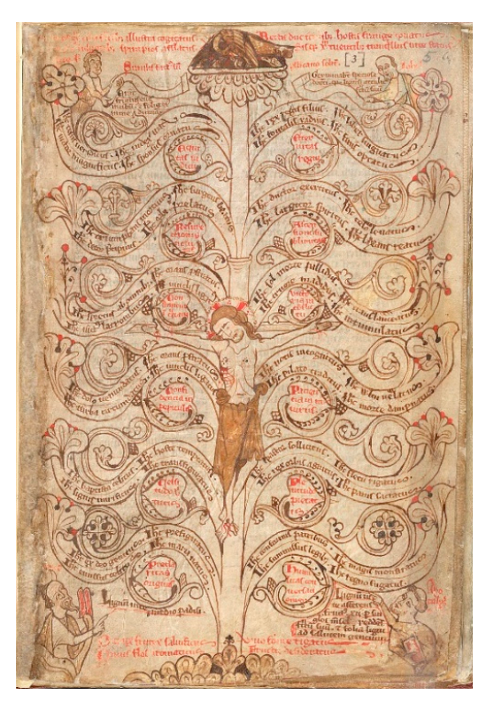
Figure 18. London, British Library Harley MS 5234, f5v, Durham, late thirteenth/early fourteenth century.

Despite the traditional representation of nails as instruments of the Passion, none of the gospel accounts actually describe Jesus as nailed to the cross. The story of Doubting