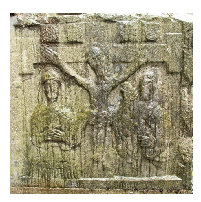
Figure 21. Purcell Tomb in St John's Priory, Co. Kilkenny, sixteenth century.