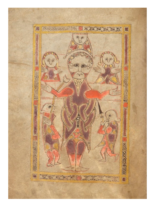
Figure 1. Southampton Psalter , Cambridge, St John's Library C 9, f35v, tenth or eleventh century.

dating to the tenth or eleventh century, stands comfortably, ready to embrace the viewer with open eyes and arms and his lips parted in speech or a gentle smile.