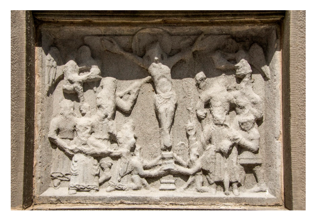
Figure 24. Creagh Tomb, Ennis Friary, Co. Clare, c.1470–1480 and reconstructed in c.1840s.

Given the power of the devotion to the five wounds, and the insistence in the literature of the power of Christ's blood in the remission of sins, it is notable that the wound in the side appears relatively infrequently in Irish art of the period. The Creagh tomb in the Franciscan friary in Ennis, c.1470–1480 (Figure 24), for example, incorporates the moment of spearing in the scene of crucifixion, <sup>10</sup> angels on the indulgence slab in Kildare (Figure 12) collect the blood flowing from the side and hand wounds in cups, and two processional crosses, those from Sligo Friary (Figure 16) and Multyfarnham Friary, c.1480–1490, both depict the side wound, but by and large this wound is absent in Irish depictions. This is a further demonstration of the restraint on behalf of Irish artists described above. While violent imagery was present in contemporary bardic poetry—vividly describing the excruciating torment and enumerating each individual wound, 'On God, Mary's son were sixteen wounds and six hundreds and fifty-six thousand'—visual artists preferred a more introverted and devotional representation of pain and suffering ( Aithdioghluim Dána , poem 78, stanza 26).