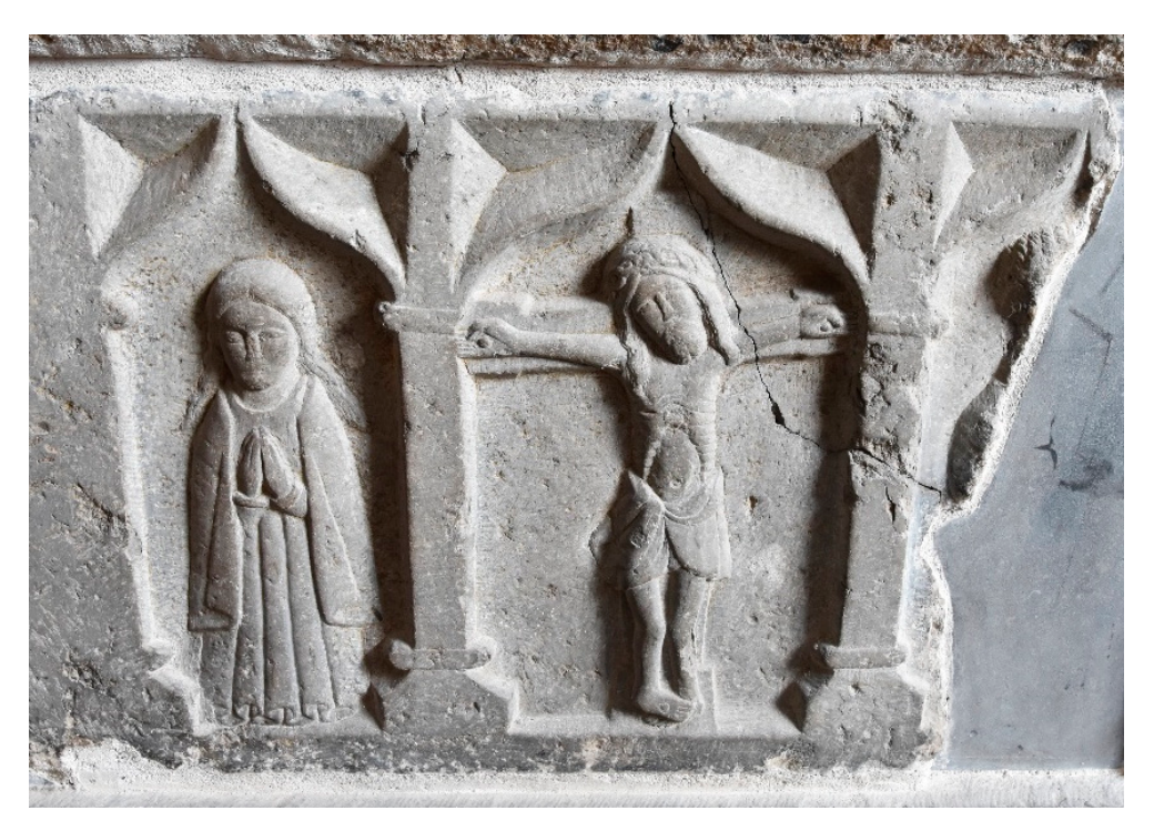
Figure 5. Tomb chest Holycross Abbey, Thurles, Co. Tipperary, second half of the fifteenth century.

said, while the cross and crucifixion may be central to Christian doctrine and the idea of salvation, the gospels themselves provide minimal information about the event itself and how the crucifixion took place. The gospel accounts describe aspects of the arrest, trial, death, burial, and humiliation, but none describe the cross itself or the manner in which he was suspended on it. The entire procedure is conveyed in a single word 'crucifixerunt' ('they crucified him'), but as historical sources and archaeological evidence suggest the methods of crucifixion were considerably varied. Artists and writers have therefore sought inspiration from a range of sources including patristic exegesis, Old Testament texts and prophecies, the Psalms, the lamentations of Jeremiah, and perhaps local laws and customs. The emaciation of Christ's body so often found in images of the crucifixion, such as on the Shrine of St Caillin, 1536, or a tomb chest in Holycross Abbey, Co. Tipperary (Figure 5) from the second half of the fifteenth century, is derived from Psalm 21 (Vulgate 22). A sermon of St Bernard on the Passion interprets 'I can count all of my bones' (Psalm 21:[22]:17) to mean that Christ was stretched taut on the cross revealing his ribcage (Merback 1999, p. 69 and chp. 6; Pickering 1980, p. 6; Jensen 2017, pp. 6–7; Viladesau 2006, pp. 115–18).