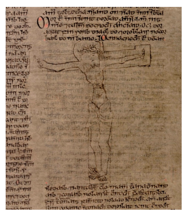
Figure 3. Leabhar Breac (Speckled Book) , Dublin, Royal Irish Academy MS 23 P 16, p166, 1408–1411.

crucifixion plaque from Fertagh, Co. Kilkenny, c.1530s (Figure 4), offer a more frightening and contorted view of agony.