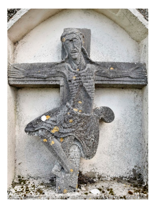
Figure 4. Crucifixion plaque, Fertagh, now at St Kieran's Church, Johnstown, Co. Kilkenny, c.1530s.

The power of the symbol of the cross is highlighted in the account of the Passion of Longinus in the Leabhar Breac . Longinus questions a group of demons about why they chose to inhabit pagan idols and the response he receives claims that they 'found the stone images [...] without the sign of the cross on them, and without being named in the name of God [...] for where Christ is not honoured, nor the sign of the cross, there is [their] dwelling forever' ( Passions and the Homilies from the Leabhar Breac , p. 302). That