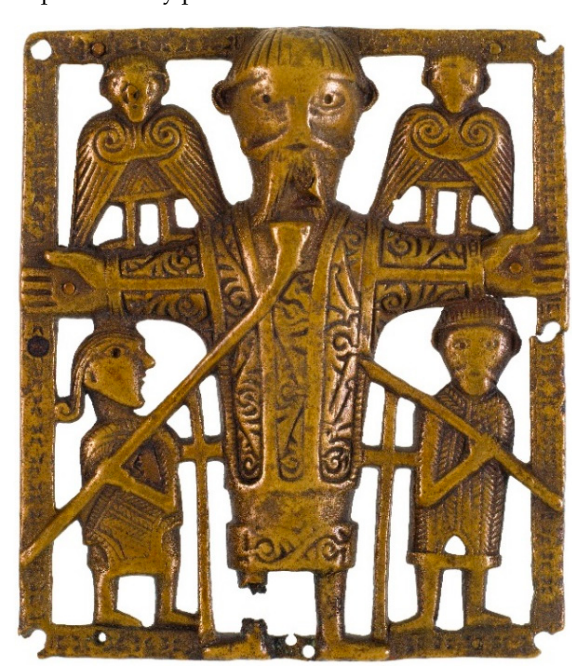
Figure 2. Clonmacnoise Crucifixion Plaque, tenth or eleventh century.

Changing theological attitudes to the crucifixion and the significance of Christ's suffering and death over the course of the eleventh and twelfth centuries throughout Europe, however, brought about a change in the iconography of the crucifixion. Anselm of Canterbury (†1109) explained that Christ's voluntary death was necessary for the remission of sins as mortals were incapable of sufficiently atoning for their own sins; only the incarnate God could do so. Anselm proposed prayers to be directed towards the image of the crucifixion, guided meditations on Christ's wounds, and encouraged experience