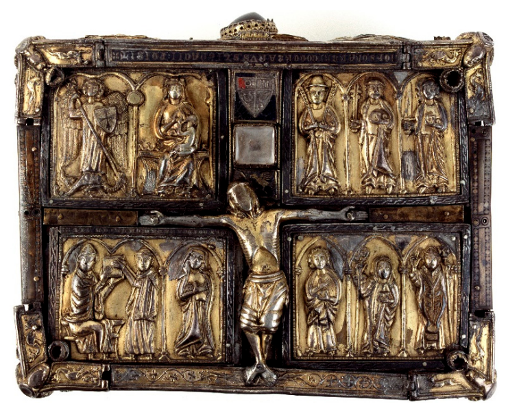
Figure 9. Shrine of the Domnach Airgid , seventh century, and refurbished c.1350 and again in the fifteenth century.