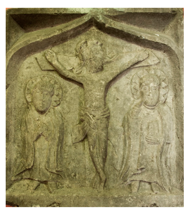
Figure 26. Tomb chest, Carmelite Priory, Co. Kildare, sixteenth century.