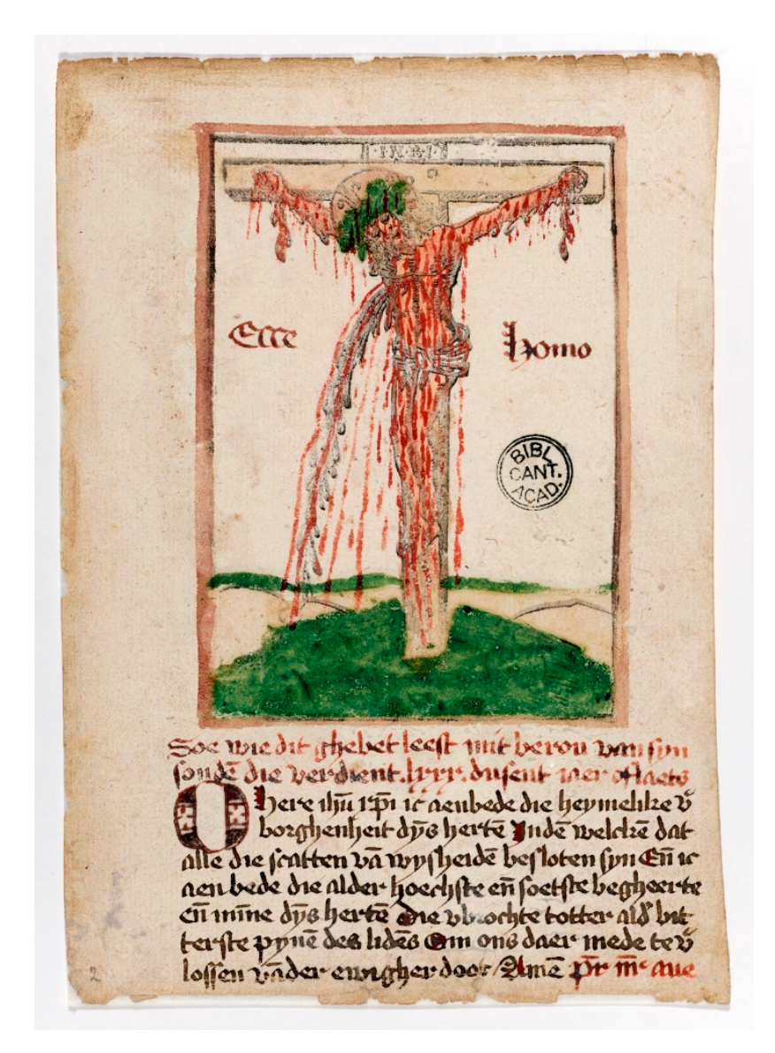
Figure 35. Cambridge University Library MS Additional 5944(11), c.1450.

The iconography of the crucifixion in late medieval Ireland is one of suffering and humiliation. In line with contemporary European iconography and thinking, Irish artists emphasised Christ's sacrifice, his pain, his blood loss, and his humiliation in order to save mankind. Unlike the graphic, bloody imagery present in Irish bardic poetry and typical of Northern European art, however, Irish artists generally preferred a more poignant and devotional approach to the scene of crucifixion. Depictions of the crucifixion were designed to move the reader, to prompt their prayers and contemplation, and to provoke their devotional gaze. Images could be powerful objects, and a scene of the crucifixion could demand an active response from the viewer: a direct interaction between object, viewer, and the suffering Christ. This is made plain in the example of the indulgenced image or devotional image where the devotee recites prayers ritualistically over a scene of the crucifixion or the five wounds hoping to receive a tangible benefit in this life or the next. On funerary monuments, imagery of the crucifixion demonstrates both the supplicant's continued devotion to the Passion and their appeal to Christ and the Trinity to aid their journey in the afterlife. Images within the church, hanging on walls, forming the windows, ornamenting the chalices, or dressing the priest or altar present a visual anchor to the congregation's prayers and help to bring alive the mystery of the Eucharist.