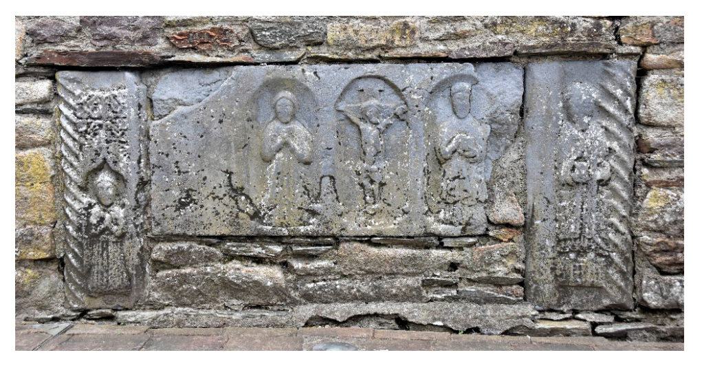
Figure 7. Tomb slab, Church of Ireland, Inistioge, Co. Kilkenny, second half of the fifteenth century.