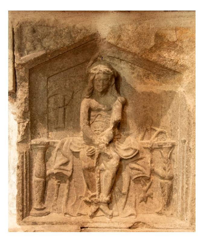
Figure 34. Ecce Homo , tomb of Bishop Walter Wellesley, formerly at Great Connell, now at St Brigid's Cathedral, Co. Kildare, c.1539.