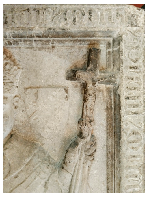
Figure 20. Tomb of Archbishop Tregury, St Patrick's Cathedral, Dublin, c.1471.