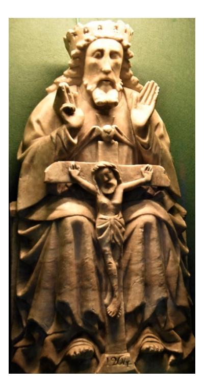
Figure 31. Throne of Grace, Black Abbey, Co. Kilkenny, first quarter of the fifteenth century.