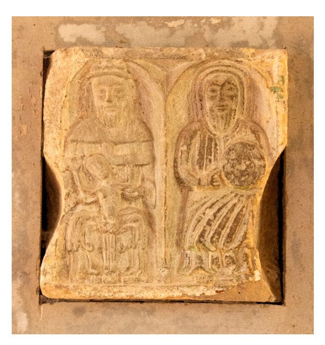
Figure 22. Throne of Grace, originally from a tomb sculpture in the Augustinian House of the Holy Trinity, Ballyboggan, now at the Church of the Assumption in Ballynabrackey, Co. Meath, early sixteenth century.

In comparison to some of the more gory and graphic representations from Northern Europe, late medieval Irish depictions of the crucifixion tend to be more reserved in their depiction of blood and horror, though this may be due, in part at least, to the surviving media. The Ballymacasey Cross (Figure 15) depicts droplets of blood in the palms of the hands. While not strictly a crucifixion scene, a miniature in the Seanchas Burcach ( History of the Burkes ), Dublin, Trinity College MS 1440, f18v, c.1570 (Figure 23a), of Christ carrying the cross is an unusually gruesome image in an Irish context. The scene shows blood streaming down Christ's face from the wounds of the crown of thorns and the cross itself is already heavily bloodstained in a foreshadowing of the event. The European influence on the artist