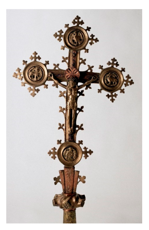
Figure 17. Sheephouse Processional Cross, c.1450.