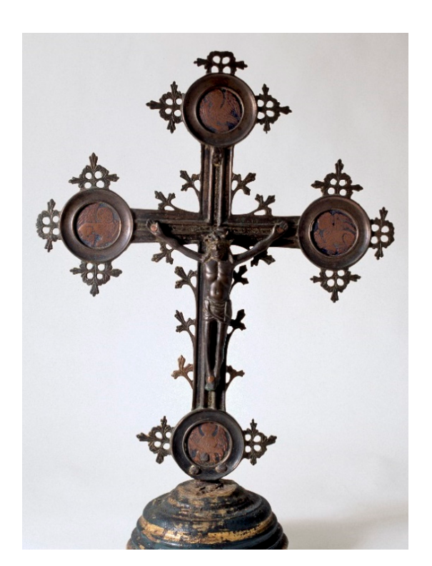
\textbf{Figure 16.} \ Sligo \ Friary \ Processional \ Cross, c. 1450. \ Reproduced \ by \ permission @\ National \ Museum \ of \ Ireland.