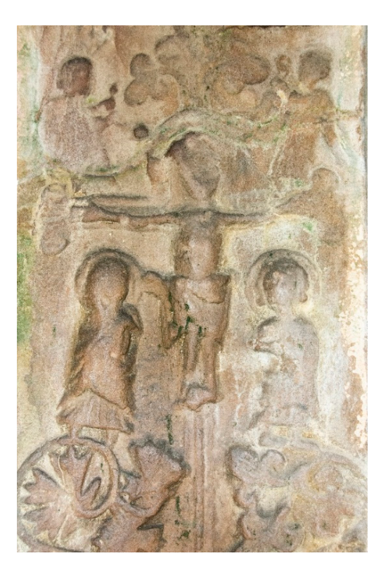
Figure 13. Double-head slab, Cathedral of St Patrick, Trim, Co. Meath, c.1325–1350.