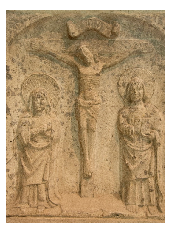
Figure 10. Tomb of Bishop Walter Wellesley, formerly at Great Connell, now at St Brigid's Cathedral, Co. Kildare, c.1539.