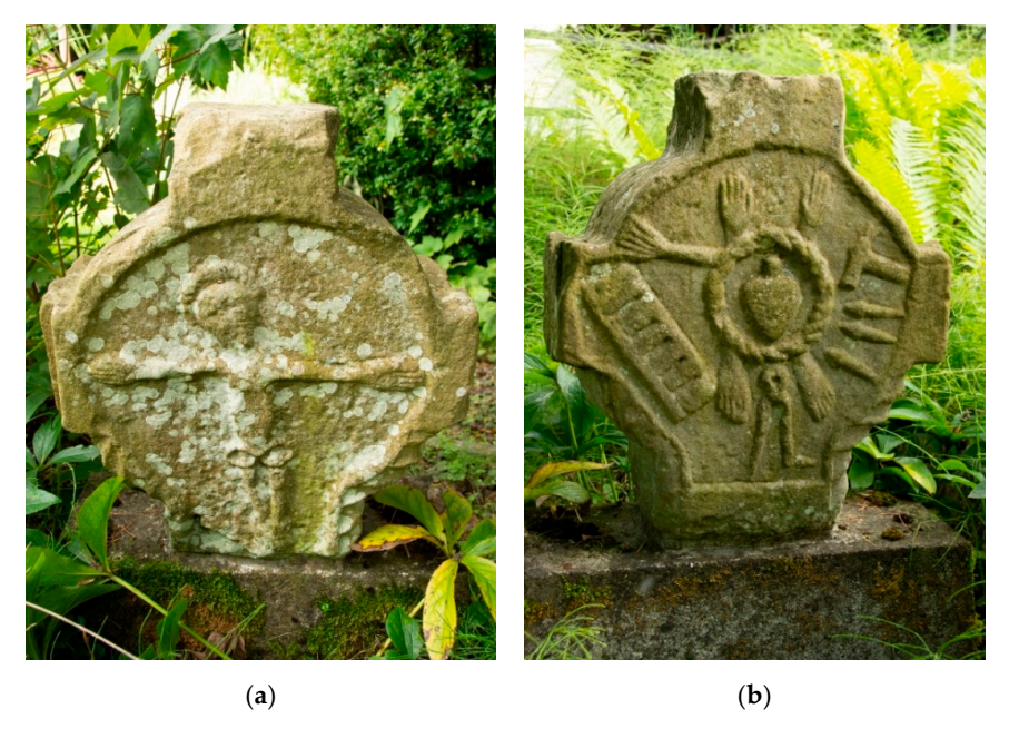
Figure 29. (a) Kilmore Churchyard Cross, now at the parish church of Moynalvey, Co. Meath, c.1575 south side, (b) north side.

The majority of images of the crucifixion in the later period in Ireland depict the crown of thorns. The preferred mode is a rope-like circlet as on a cross from Kilmore Churchyard, Co. Meath, c.1575 (Figure 29a), the fifteenth-century Effigy of Two Butler Knights in Gowran, and the tombs of Walter Brenach and Katherine Poher in Jerpoint Abbey (Figure 19) and Piers Butler and Margaret Fitzgerald in St Canice's, Co. Kilkenny (Figure 28), though interlaced versions occur in the Leabhar Breac (Figure 3) and Holycross Abbey (Figure 5), and spiked versions appear on the Sheephouse (Figure 17) and Sligo Friary (Figure 16) processional crosses. Passion narratives across Europe in the fourteenth and fifteenth centuries elaborated on the torments of Christ, describing his beard being pulled, his cloak removed with such violence that it pulled pieces of flesh with it, and the thorns in the crown 'so sharp and long that they pierce his brain-pan.' This elaboration in text is paralleled in the contemporary elaboration in imagery with the introduction of new themes and motifs including the Man of Sorrows and Pietà, and an increased attention paid to the role of the Virgin in the Passion (Bestul 1996, p. 146; Viladesau 2006, p. 155).