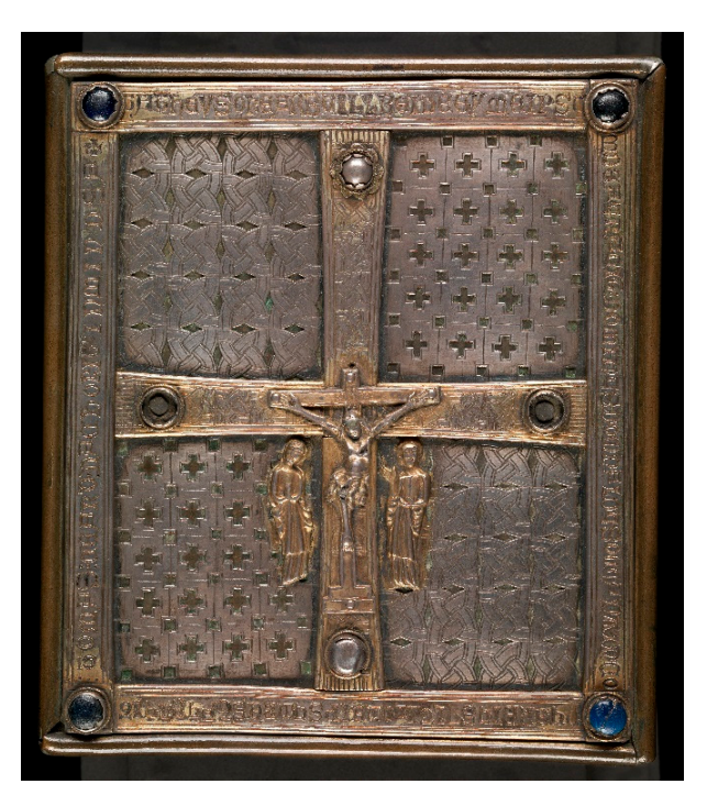
Figure 8. Shrine of the Book of Dimma , twelfth century and refurbished c.1380–1407.