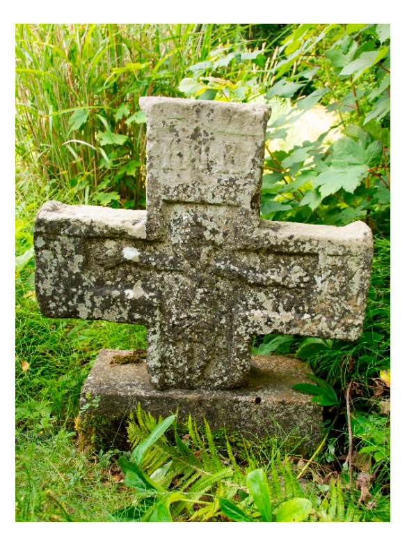
Figure 11. Arodstown Wayside Cross, now at the parish church of Moynalvey, Co. Meath, c.1590.