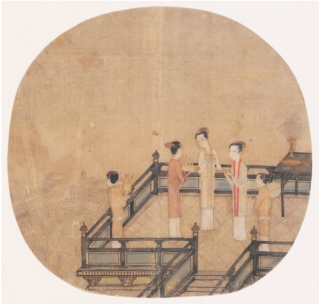
Figure 10. “A Picture of Walking under the Moon on Yao Tai”. Dimensions: H. 25.6 cm × W. 26.7 cm. Silk color painting. The Palace Museum, Beijing, China.

had access to the best medical care, over 45% of the 181 royal children born throughout the Song Dynasty died at young ages, excluding two who died in war (Wang 1984, p. 51).