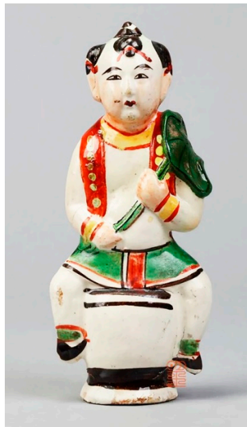
Figure 6. White-glazed red and green porcelain statue of Mahoraga child in the Song Dynasty. Materials: porcelain. Dimensions: H. 17.5 cm × W. 7.5 cm. Wangye Museum, Shenzhen, China.