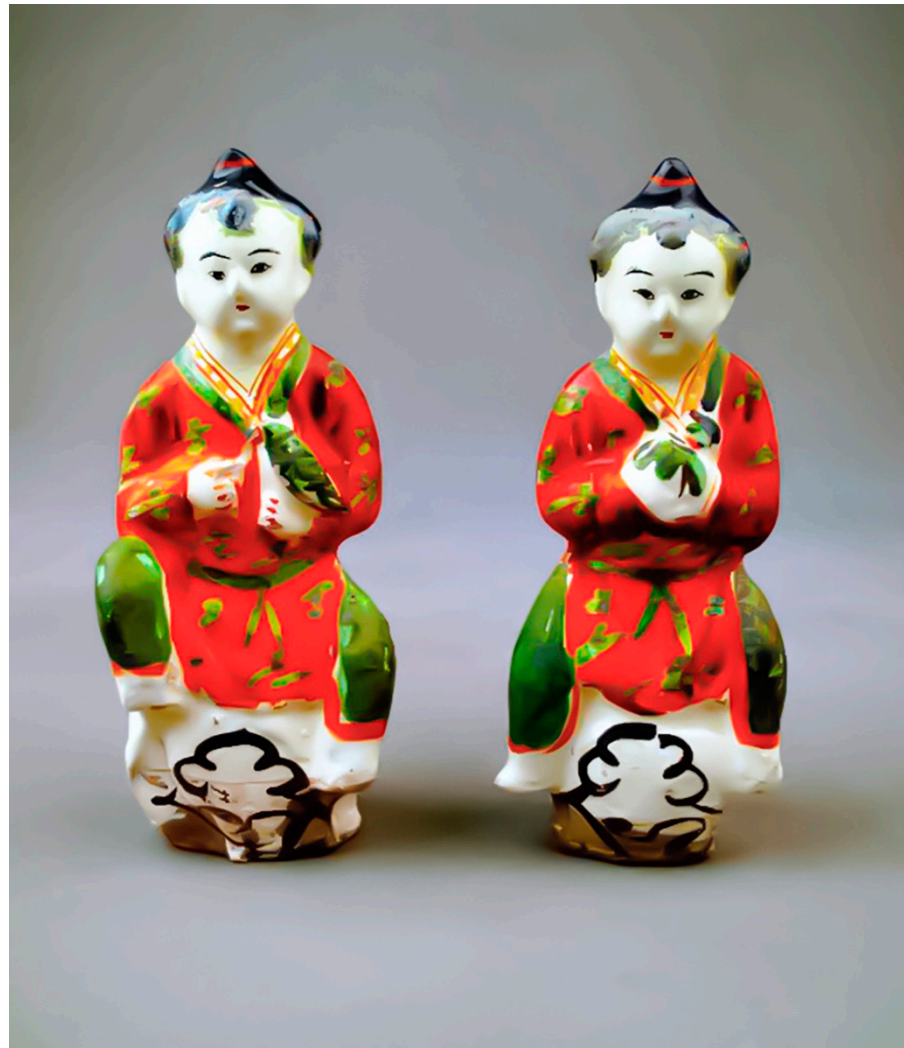
Figure 1. A pair of ceramic Mahoraga dolls from the Song Dynasty. Materials: Porcelain. Dimensions: left H. 17.6 cm × W. 7.5 cm, right H. 17.3 cm × W. 7.2 cm. Wangye Museum, Shenzhen, China.

decoration art (Sun 2014, pp. 135–43). Liu Jun based his argument on the transformation of the three artistic images of the Indian Brahminism “Mahākāla”, concluding that Mahoraga dolls in the Tang and Song Dynasties were a result of the confusion of “Mahākāla” and central China folk culture 2 . In this process, Mahoraga gradually changed from a revered god to a child’s toy conveying the meaning of praying for reproduction and blessings (Liu 2012, pp. 92–93).