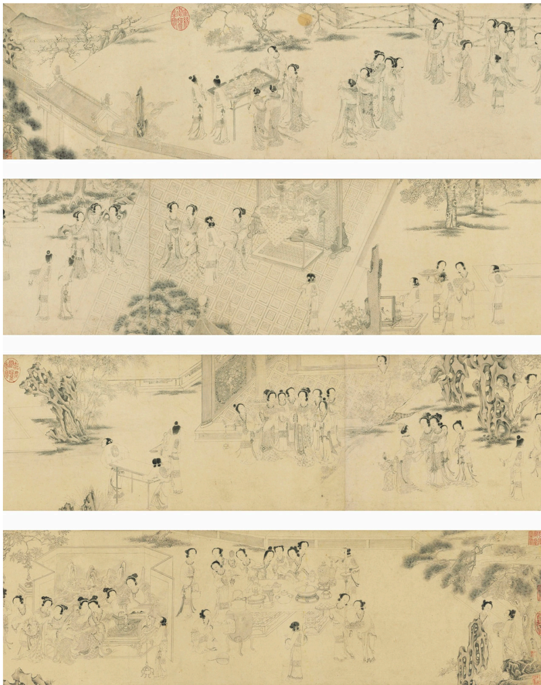
Figure 8. “Praying for the Ingenuity” by Chouying in Ming Dynasty, dimensions: H. 27.9 cm × W. 399.3 cm. Paper ink scroll. Collection of the Palace Museum in Taipei.