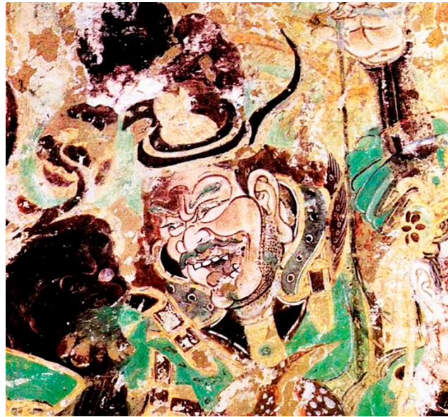
Figure 3. Mahiraga detail of the Seven Buddha of Healing Master 七佛药师 (Editorial Board of the Complete Collection of Chinese Fine Arts 2015, p. 15). Cave 220 of Mo Kao Grotto at Dunhuang, China.