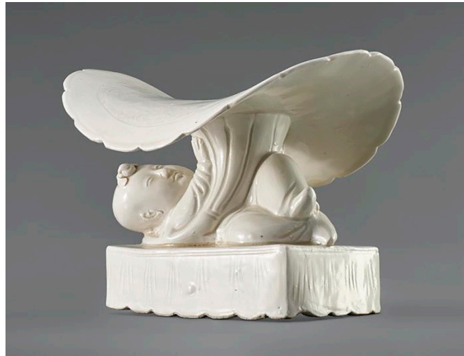
Figure 5. Stool in the form of a boy and a lotus leaf from the Song Dynasty. Materials: porcelain with glaze. Dimensions: H. 8.3 cm × W. 20.3 cm × D. 16.5 cm. Collected in the Asian Art Museum of San Francisco. 7

This white-glazed stool from Hebei, China, is 21 cm long, 17.1 cm wide, and 15.8 cm high. It depicts a scene of a baby wrapping his hands around a lotus leaf. This work can be divided into three parts: the base, the child, and the lotus leaf. The base is rectangular. The child lies on his side on the base, face up, his legs curled up, and his hands around the lotus leaves. The lotus leaves droop back and forth, warp left and right, and are concave in the middle, forming a curved surface suitable for a stool.