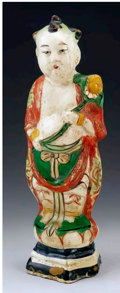
Figure 7. Red- and green-colored porcelain statue of a standing Mahoraga child in Cizhou Kiln in the Song and Jin Dynasties. Materials: porcelain. Dimensions: H. 30.8 cm × W. 9.5 cm. Tianjin Museum, China.