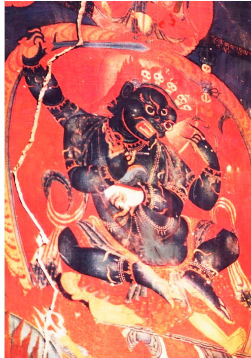
Figure 2. The image of Mahākāla (Sun 1989, p. 51). White Temple in Gurge Kingdom relics, China.

at the site of the Gurge Kingdom (800–892) in Zada County, Tibet, there is a four-armed image of Mahākāla (Figure 2). Its body is covered in black. Cakravartin is sitting on a goddess, 5 with an expression of fury on his face and his red hair pointing straight upward. He wears a crown of five skulls. His left hand holds a trident and an alms bowl, while his right hand carries a sword and a cradle drum. The furious Mahākāla is made to intimidate demons and monsters and is very different from the cute child statue. However, there is no direct connection between its guardian duties and the function of Mahoraga in worship, for which further explanations are lacking in Hu’s article.