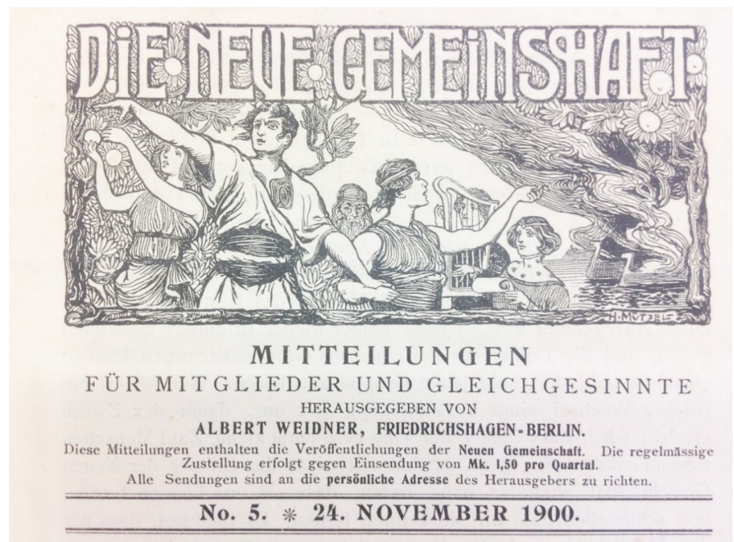
Figure 1. Front material of one of the group's pamphlets.

Things changed somewhat when, in 1901, the Hart brothers rented a four-room apartment on Uhland Street in Berlin's Wilmersdorf for the use of their emerging cultural center. The announcement about the new apartment mentions decorated and furnished rooms, a library with books and magazines, sculptures, and works of art. It notes that "drink and food" will be provided, and it invites members and their guests to come between ten in the morning and midnight. 14 Mühsam describes the atmosphere at the apartment with the following words: