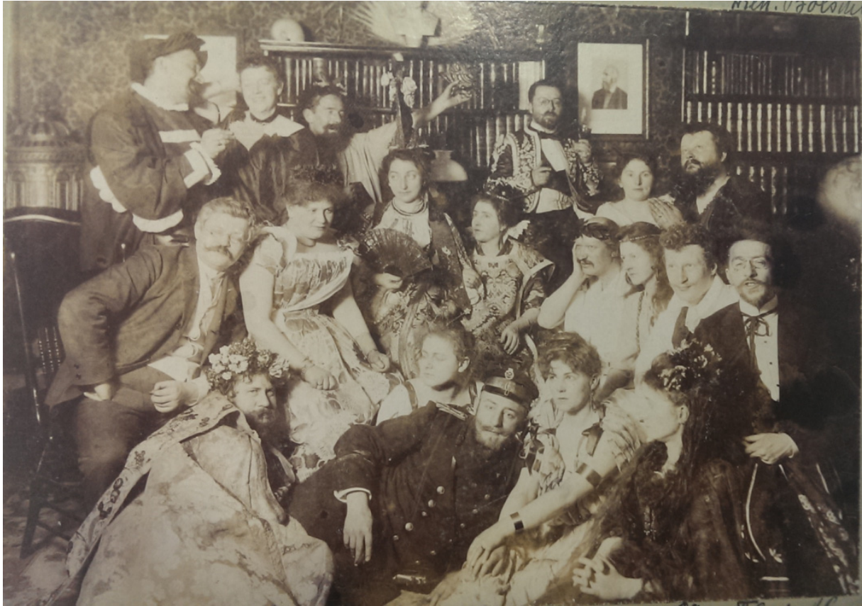
Figure 2. An undated image that seems to depict a costume party at the Uhland Street apartment.

music, but more importantly for Berlin's bohemians, the group's apartment was a place to see and be seen, to learn, argue, listen, and sound off. Although the Neue Gemeinschaft was not the subject of any famous text and no groundbreaking work was produced by its members, it played a significant social role.