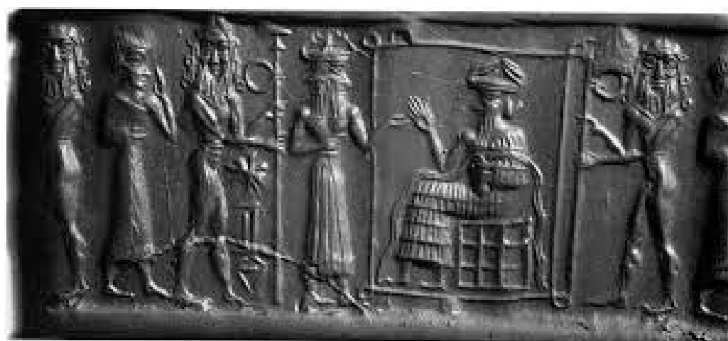
Figure 3. The Janus-faced god Usmû introducing a suppliant before the god Enki sitting in a shrine guarded on two sides by the lahmu , Old Akkadian Period (Adapted from ref. (Porada 1993, Figure 15)).