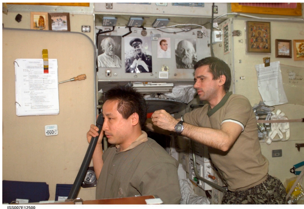
Figure 9. An “Honour Wall” in Zvezda.