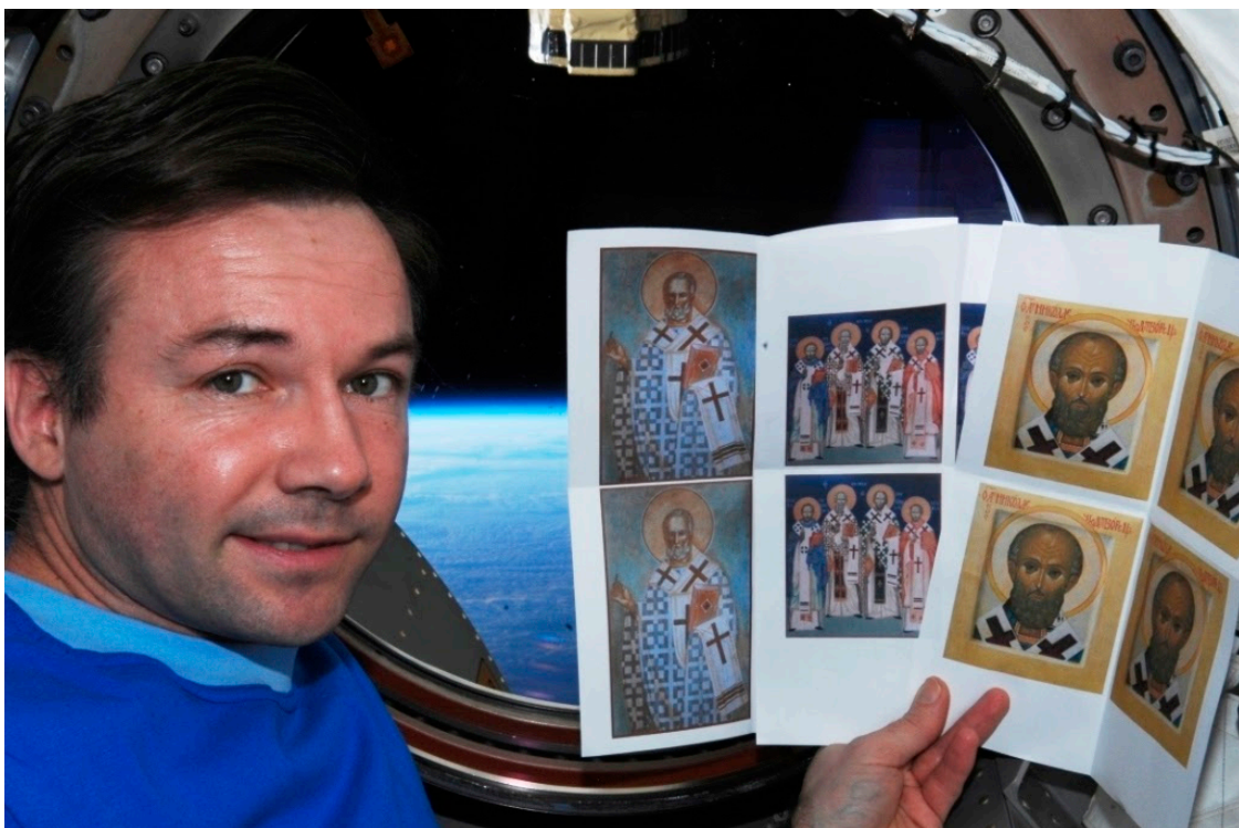
Figure 6. Cosmonaut Yuri Lonchakov with printed icons.