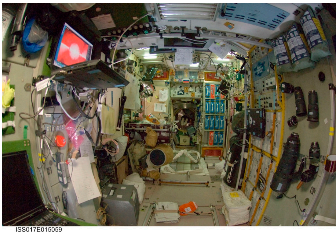
Figure 10. Sacred space in the International Space Station.

ISS combines what in terrestrial architecture tend to be separate buildings or spaces: domestic, workplace, private, public, laboratory, gymnasium, television studio, cargo hold, etc. (Figure 10). None of the segments were designed to incorporate the functions of worship or to cater to individual religious beliefs. Thus the creation of a hierotopic space on the aft wall of Zvezda has required cooperation between the crew, who willingly transport icons and other religious objects back and forth, Roscosmos, which must authorize and document every item allowed on board, and the church hierarchy on the ground, who orchestrate what is represented and when, in accordance with the liturgical calendar as well as events occurring in the geopolitical sphere. The placement and change of items over time as seen in the images analyzed is ad hoc, in the sense that the process does not follow a clear order, but also organized, in that certain types of objects seem to be clustered in various locations.