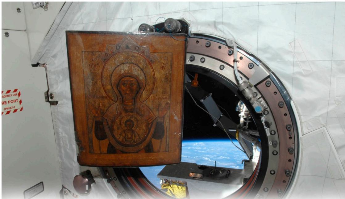
Figure 5. Icon of the Mother of God of the Sign with Earth in the background.

Lonchakov at the porthole holding up three sets of identical color-printed images of icons of Saint Nicholas and selected saints (Figure 6) 9 .