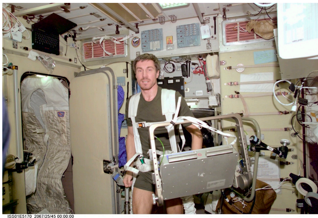
Figure 1. The Zvezda module in 2000, showing an icon of Saint Theodor of Tiron.

tend to treat nadir as "down" and zenith as "up". Our use of directional descriptors in this article, including "high" and "low", reflect this convention.