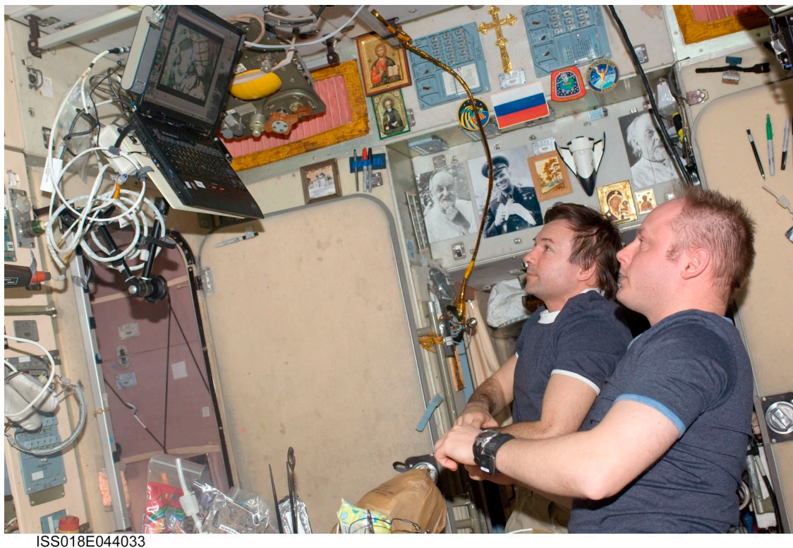
Figure 2. The space heroes Konstantin Tsiolkovsky and Yuri Gagarin displayed in the “niche” of Zvezda’s aft wall.