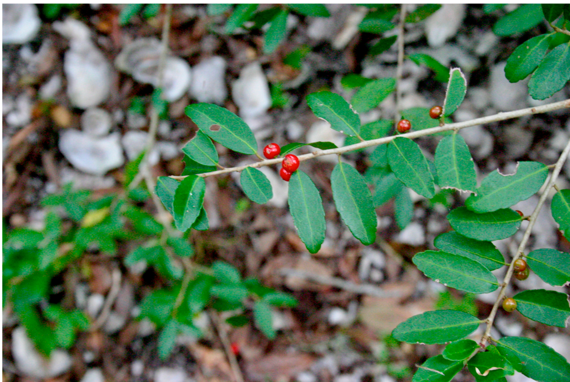
Figure 10. Yaupon plant growing on Shell Mound.