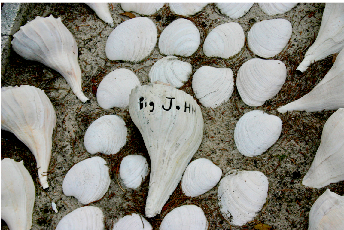
Figure 5. On one of the graves, a large shell is engraved with the words, "Big J. HH".