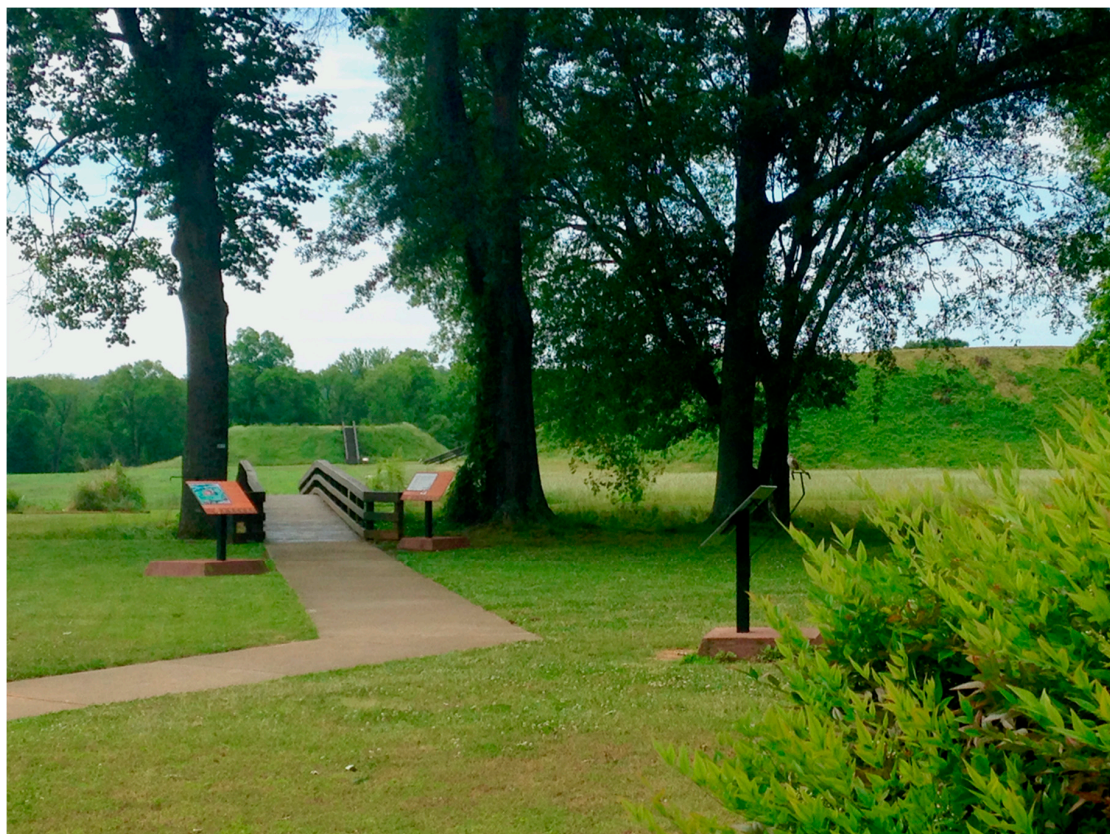
Figure 2. Etowah Mounds, Bartow County, Georgia (c. 1000–1550 CE).