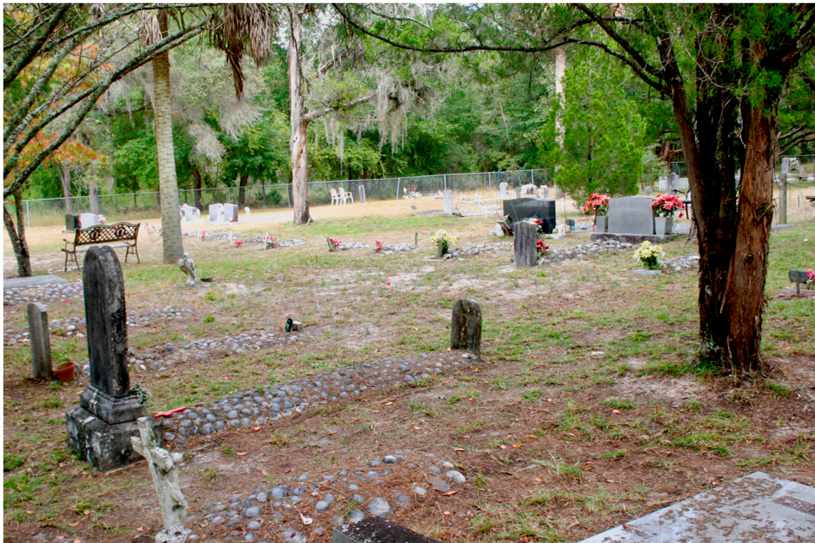
Figure 4. Graves at the cemetery, many covered with shells.