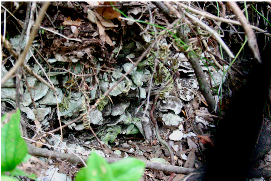
Figure 8. Stratigraphy of shell and dark organic soil peaking out from beside the walking path at Shell Mound.