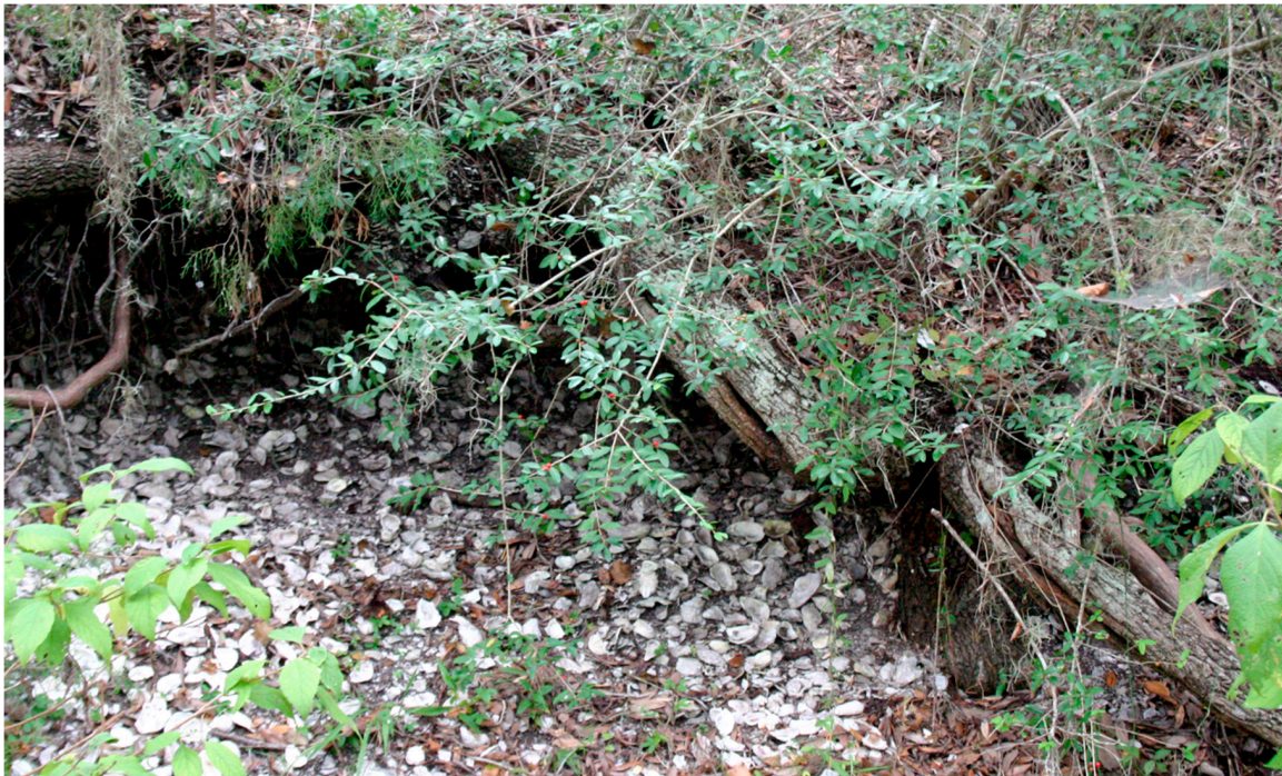
Figure 7. Shells visible under plants growing on Shell Mound.