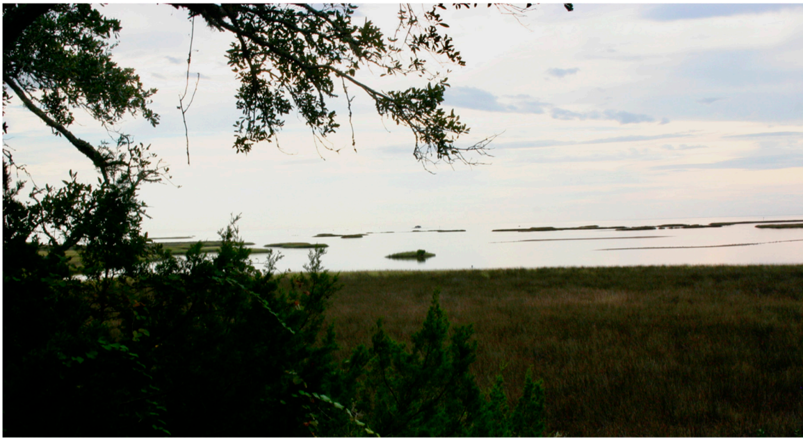
Figure 9. The view from Shell Mound.