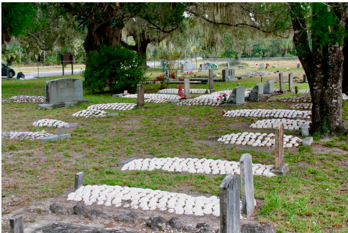
Figure 3. Photograph of the cemetery, in which recently bleached shells carefully arranged atop many of the graves.