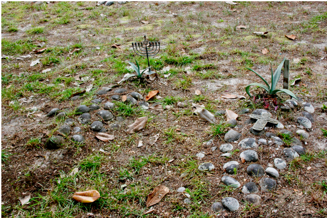
Figure 6. Two children's graves arranged with discolored shell. The graves each have a plant at the head, along with a menorah and a cross, respectively.