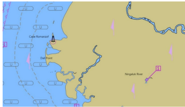
Figure 2. Category of Zones of Confidence (CATZOC) on Electronic Navigational Charts (ENC) chart [13].

Navigational charts contain mixture of data from different surveys throughout many years with different methods that are connected to form a single chart. Details and interpretation of data quality was varied between hydrographic offices, so International Hydrographic Organization (IHO) developed a new international system, the ZOC system, that will be used by all countries within S-57 Electronic Navigational Charts [14].