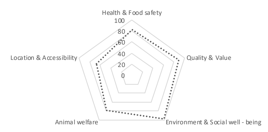
Figure 3. Knowledge or awareness of organic pork among Thai consumers.