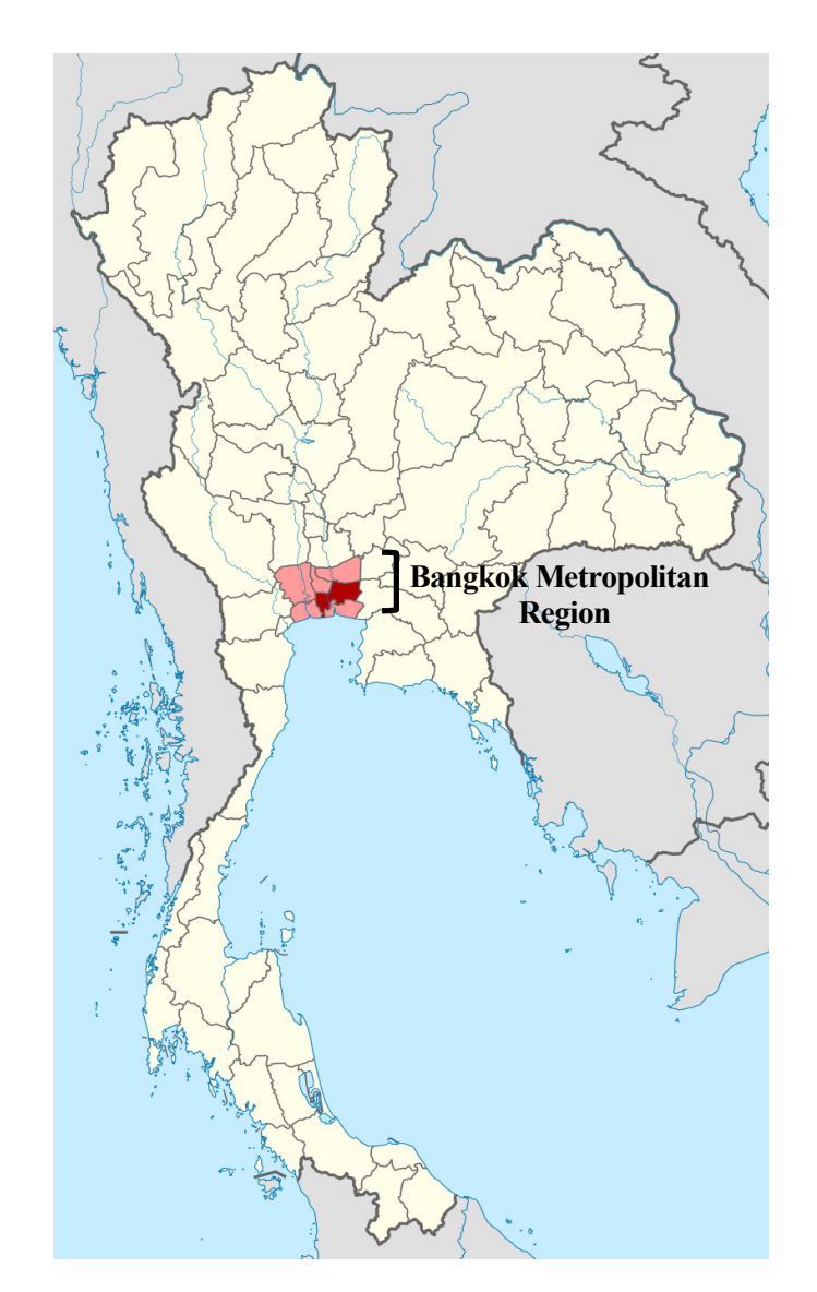
Figure 2. Map of Bangkok Metropolitan Region, Thailand (the darker area represents Bangkok).