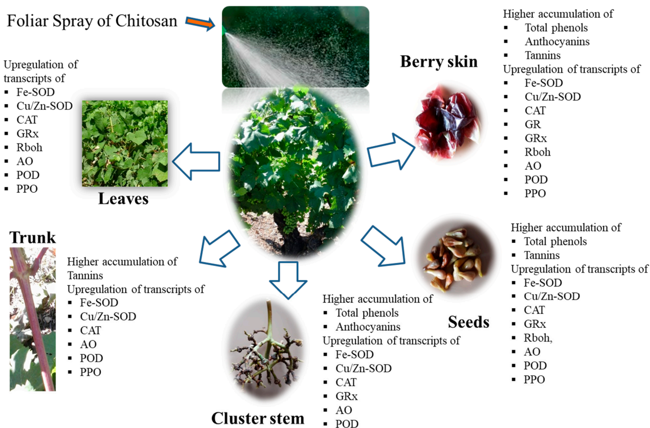
Figure 2. Diagrammatic representation of effect of chitosan application in grapevine in tissue specific manner at a molecular and biochemical level where different genes denominated as iron-superoxide dismutase (Fe-SOD), copper-zinc-superoxide dismutase (Cu/Zn-SOD), catalase (CAT), glutathione reductase (GR), glutaredoxin (Grx), respiratory burst oxidase (Rboh), amine oxidase (AO), peroxidase (POD) and polyphenol oxidase (PPO).

antioxidant potential was also recorded as higher upon chitosan treatment as a modulation of genes belonging to ROS pathway was noticed. In particular, Cu-Zn/SOD, catalase, amine oxidase, peroxidase (POD) and polyphenol oxidase (PPO) were observed as up-regulated in the trunks in both of the varieties upon chitosan treatment. The total tannins were observed to be much higher in trunks of chitosan-treated plants in comparison to control. Such a plant immune response suggests an improved trunk health of grapevines; however, a similar possible solution in terms of preventing grapevine trunk diseases is yet to be explored. Another study by our group demonstrated the upregulation of basic genes of phenolic compounds during the veraison stage in the Tinto Cao variety [76].