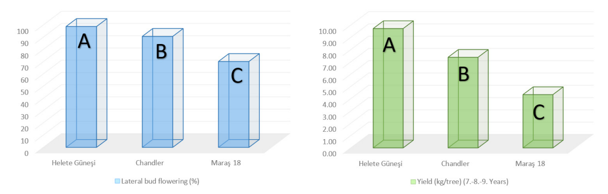
Figure 2. A comparison of three cultivars in terms of yield per tree and lateral bud flowering. Different letters over the columns represent significant differences based on the LSD multiple range test (p = 0.05).