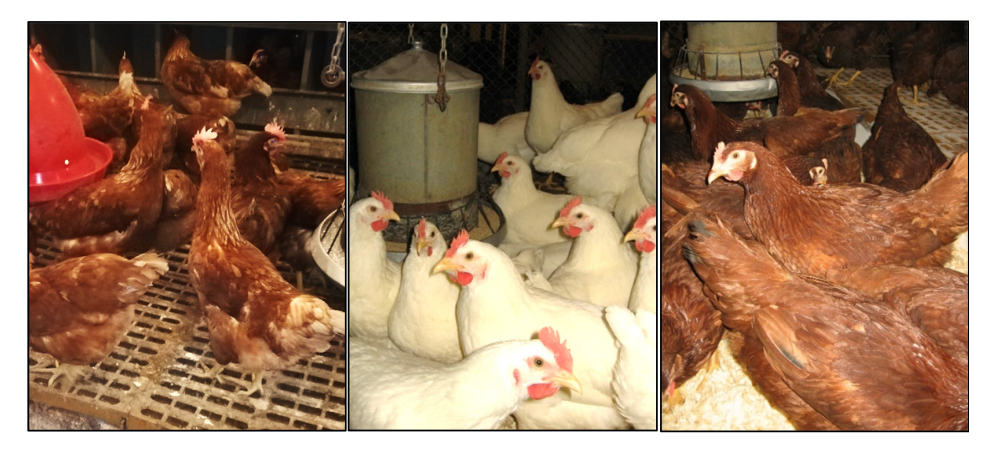
Figure 1. Experimental stocks with three different genetic backgrounds (commercial hybrid ( left ), purebred offspring of maternal (in the middle ) and paternal lines ( right )).

a2 = purebred male line offspring group (maternal); a3 = purebred female line offspring group (paternal)) (Figure 1). The set numbers are: N = 636; n = 212 hen/genotype; 53 hen/pen. The laying hens were not beak trimmed. The barn typically had a temperature of 15–18 °C and humidity between 65% and 70%. Lighting of 16 h (continuously between 5:00 and 21:00; 30 LUX, warm white) per day was used during the experimental period. Laying hens were allowed to consume ad libitum commercially available hen feed (175.1 g/kg of CP, 39.8 g/kg of CF, 11.50 MJ of ME, 34.2 g/kg of Ca, 5.4 g/kg of P, 8 mg/kg of Cu, 80 mg/kg of Zn, 50 mg/kg of Fe, 100 mg/kg of Mn, 1 mg/kg of I, 0.3 mg/kg of Se) from 2 suspended hand-filled feeders (trough length: 120 cm) and drinking water from a suspended open water drinker (trough length: 120 cm) in each pen (Figure 2).