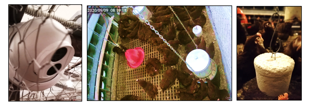
Figure 2. Infrared camera installed in the pen; HD-quality recording; pen interior layout with suspended beak wear material.

A total of 53 nineteen-week-old pullets (1041 cm2/hen) were housed in the 12 alternative pens, each with a floor area of 5.52 m2. In each pen, 1/3 of the floor space consisted of a scratching area littered with wood shavings, while the remaining 2/3 of the floor space consisted of an elevated plastic grid floor (Figure 2).