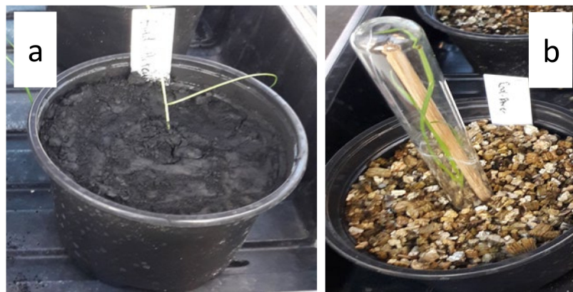
Figure 1. General overview of the experimental unity and the preparation for herbicide application. (a) A pot ( \varnothing = 10 cm) with vermiculite and an emerging L. multiflorum plant after charcoal had been added on the top of the vermiculite preventing the herbicide from leaching to the growth substrate and the roots, to account only for leaf absorption. (b) A pot ( \varnothing = 10 cm) with vermiculite and an emerging L. multiflorum plant covered with a glass tube supported by a wood stick ready to be sprayed, to account only for soil absorption of the herbicide.

Three weeks after spraying, the plants were harvested by gently removing the vermiculite from the roots in a water bath. Fresh weights of shoots and roots were recorded.