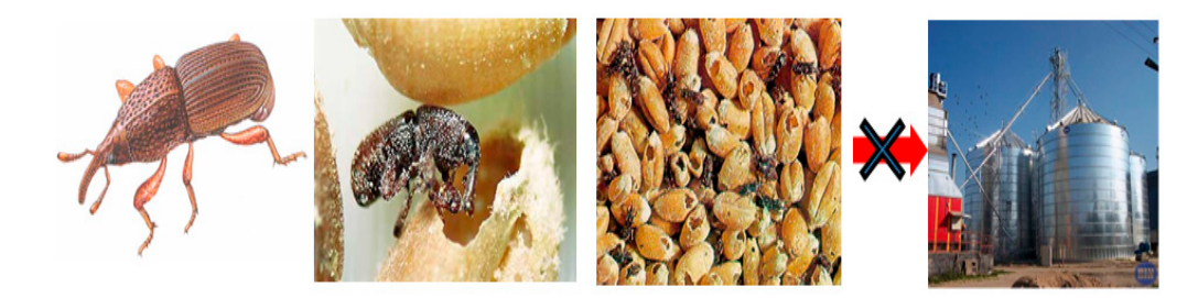
Figure 1. Grain weevil (Sitophilus granarius L.) in the context of the grain storage process [16].

Grain weevil ( Sitophilus granarius L.) (Figure 1) is a winged cosmopolitan beetle from the Curculionidae family. Although it belongs to the subclass of the winged insects, it is deprived of volatile wings. It belongs to the group of the most damaging storage pests. Depending on the age of the individual, the grain weevil's color ranges from light-brown to black.