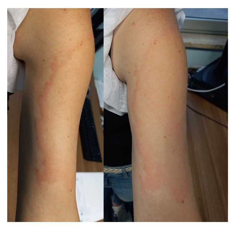
Figure 1. Erythematous, edematous, marginated Erythema migrans-like COVID Vaccine Arm eruption 7 days after the first dose of the Moderna vaccine.

Usually, CVA resolves spontaneously within a few weeks. However, some patients are treated with systemic antihistamines, and topical or oral glucocorticoids in order to relieve subjective symptoms [8] (Figure 1).