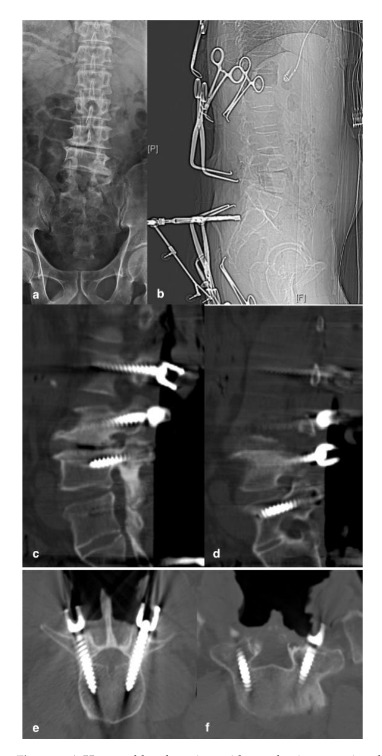
Figure 2. A 55-year-old male patient with post-laminectomy instability and spinal stenosis; X-ray (a) showed previous laminectomy of L4, L5 and partial L3. This patient underwent revision spinal surgery with the use of iCT-navigation; X-ray (b) showed the reference array fixed at the spinal process of S1 for iCT-navigation. Intraoperatively, after all screws were inserted, the confirmatory CT scan demonstrated sagittal and axial views of screws ( c , e ) at the virgin site and ( d , f ) at the revision site.