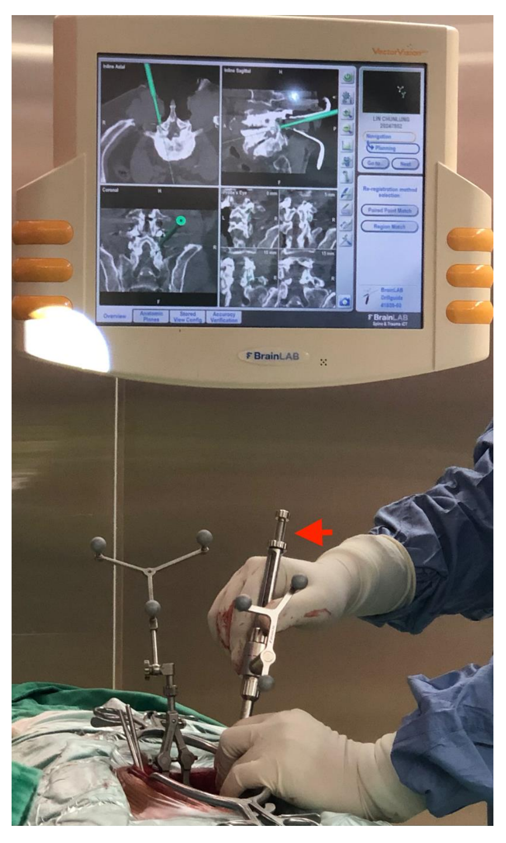
Figure 1. The straight drilling guide (red arrow) was used to guide a 2.7 mm in diameter drill bit to create the optimal TPS track under iCT-navigation by checking the axial, sagittal and coronal views.