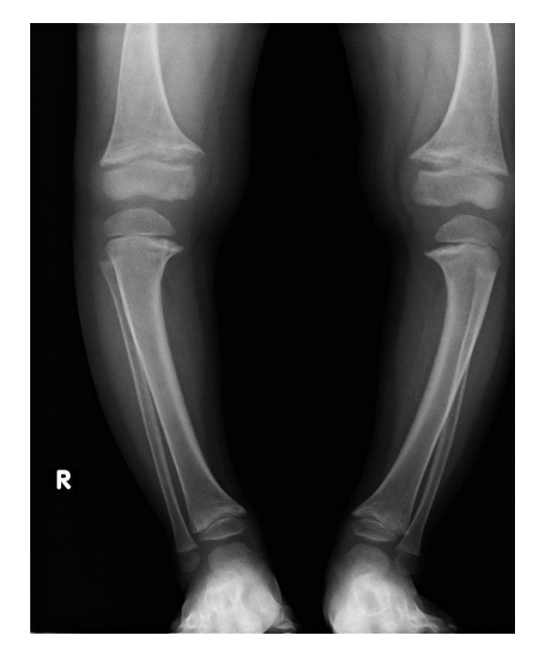
Figure 2. A 5-year-old girl diagnosed with hypophosphatemic rickets; significant varus deformity of the lower extremities.

Other symptoms present also in different types of rickets include the following: short stature (non-treated adults reach body height of 130–165 cm), weakening of muscle strength and exercise performance, expansion of long bone metaphyses, rachitic bracelets and rachitic rosary. Skull bone deformities may include craniosynostosis, protruding forehead and hypoplastic central part of the face, as well as peridental lesions and elongation of teeth crowns. Adults in whom the disease was not diagnosed and no treatment was implemented develop multiarticular pains, chronic fatigue, depression, symptoms suggestive of ankylosing spondylitis and entezopathies (calcification of the tendons, ligaments and articular capsules) [5,7–10].