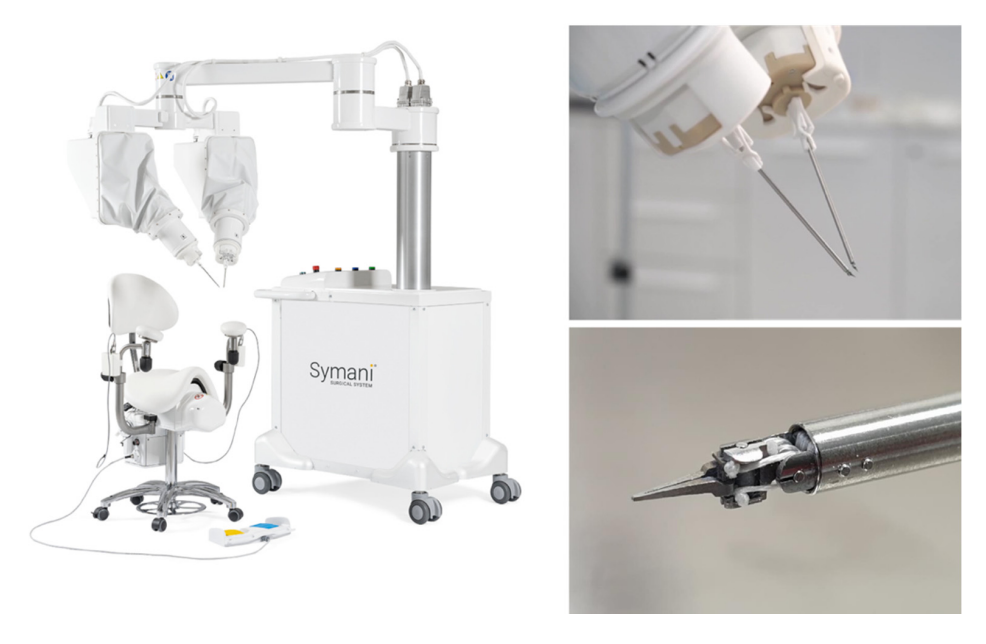
Figure 3. Robotic microsurgery system Symani from MMI.