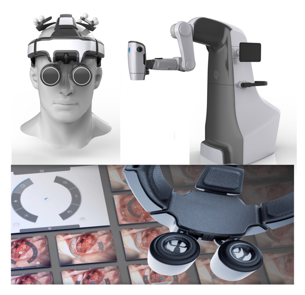
Figure 4. Robotic microscope system RoboticScope from BHS Technologies.