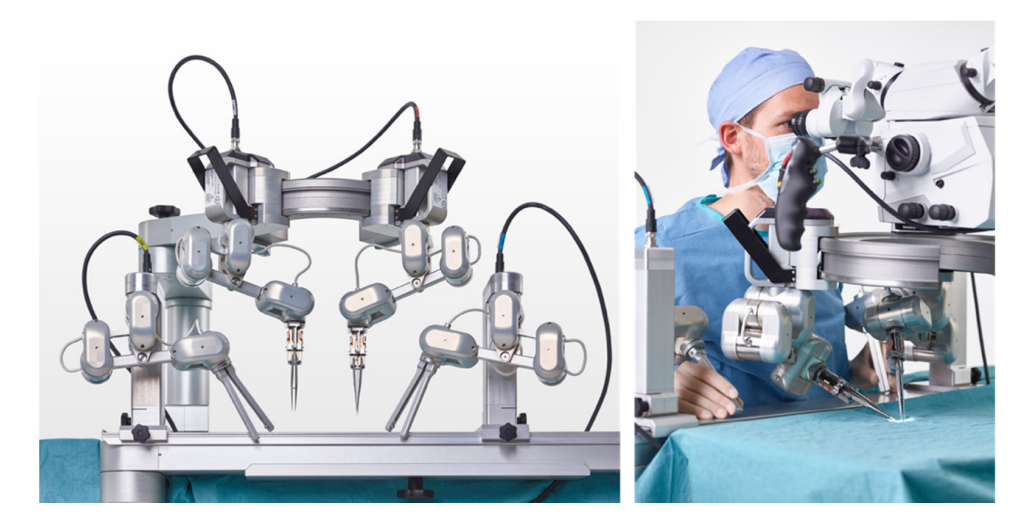
Figure 2. Robotic microsurgery system MUSA from MicroSure.

This can be considered the beginning of RAS in microsurgery. Already this initial approach showed the limitations of existing systems, given by the insufficient optical magnification and instrument size. Therefore, robotic platforms customized for the needs of microsurgery were created. These systems have multifaceted goals: (a) to effectively filter tremors, (b) to downscale movements beyond the da Vinci's capacities, (c) to provide sufficient magnification, and (d) to be easy to integrate into the OR settings for microsurgical procedures. The Microsurgical Robot (MSR), the MUSA (MicroSure, Eindhoven, Netherlands—Figure 2), and the Symani System (MMI, Pisa, Italy—Figure 3) were developed to meet the aforementioned criteria. These systems are currently in a phase of clinical evaluation and potentially impact the field of microsurgery.