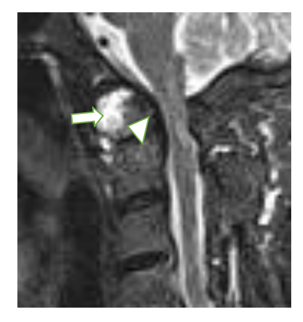
Figure 2. Sagittal MRI, T2-w TIRM image in a 65-year-old female with rheumatoid arthritis shows dens erosions (arrowhead) and periodontal effusion and pannus (long arrow). MRI: magnetic resonance imaging, TIRM: turbo inversion recovery magnitude.

At the C1/C2 level, the most frequently diagnosed abnormalities (apart from anterior AAS) were (Table 1) vertical AAS (25 [10%] seen on MRI, 27 [11%] on radiography), posterior AAS (11 [5%]) and lateral AAS (7 [3%]); the latter two were observed only with MRI. Dens erosions were seen in 36 patients (15%; Figure 2) on MRI, while radiography showed dens erosions in 11 subjects. With MRI only, pannus was diagnosed in 50 patients (21%; Figure 3), periodontal effusion in 26 (11%), BME in 11 (5%), and contrast enhancement of bone (osteitis) and/or synovium in 12 (5%) patients. MRI showed brain steam compression in eight patients (3%).