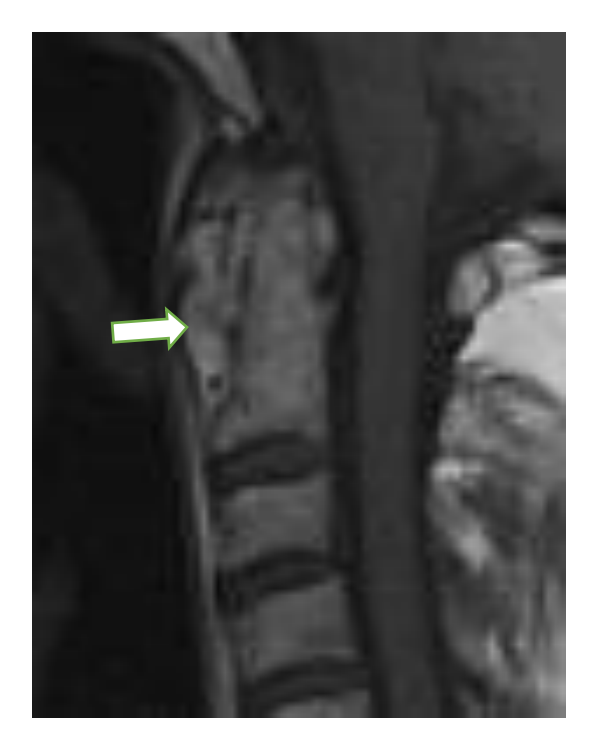
Figure 3. Sagittal postcontrast MRI, T1-w image in a 76-year-old female with rheumatoid arthritis with pannus formation in periodontal area (arrow). MRI: magnetic resonance imaging.