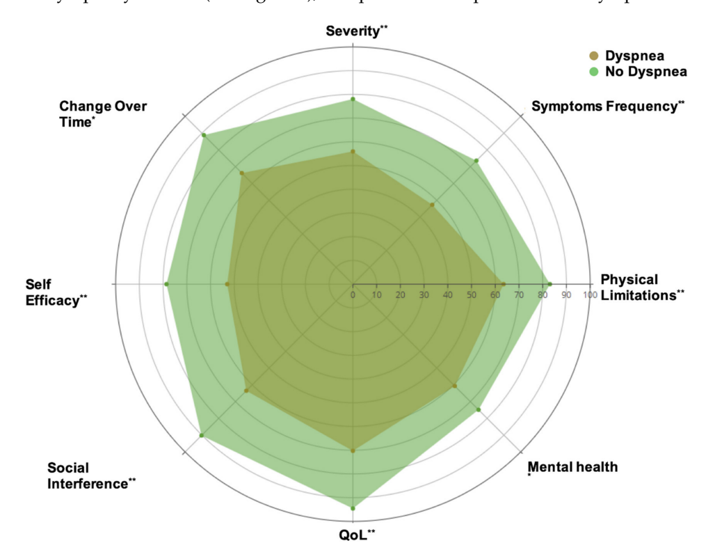
Figure 1. Quality of life assessment with Kansas City Cardiomyopathy Questionnaire (KCMQ). * (p < 0.01) and ** (p < 0.001) indicate significant differences.

Patients with persistent dyspnea presented lower global KCCQ scores, both in the physical and emotional domains (p < 0.001) (see Figure 1). There were no significant differences (p > 0.05) in hemoglobin (14 (13.1–15.2) vs. 14.2 (13.7–16) g/dL), hs-CRP (1.75 (1–4.25) vs. 1.2 (1–2.15) mg/L), IL-6 (3.6 (2.6–4.7) vs. 3.2 (2.5–3.7) pg/mL), ferritin (94.3 (46.1–142.1) vs. 145.3 (51.6–181.2) ng/mL), D-dimer (268 (221–352) vs. 246 (180–384) ng/mL), and NT-ProBNP (37 (19.5–55.4) vs. 65 (29–127) pg/mL) in either group, with the exception of the neutrophil-to-lymphocyte ratio (1.8 (1.17–2.12) vs. 1.32 (0.98–1.76); p = 0.022). A detailed summary of all parameters and some additional parameters are summarized in Table 2. Notably, inpatients showed a trend towards normalization (from hospital admission to follow-up) of all the inflammatory indices (hs-CRP, IL-6, ferritin, and D-dimer) and lymphocyte count (see Figure 2), irrespective of the persistence of symptoms.