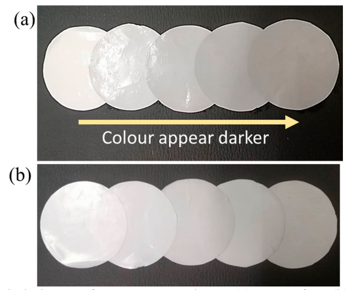
Figure S1. Digital picture of TFN-GO membrane (a) top surface (b) bottom surface. From left TFN-0GO, TFN0.1GO, TFN0.25GO, TFN-0.5GO and TFN-1.0GO.