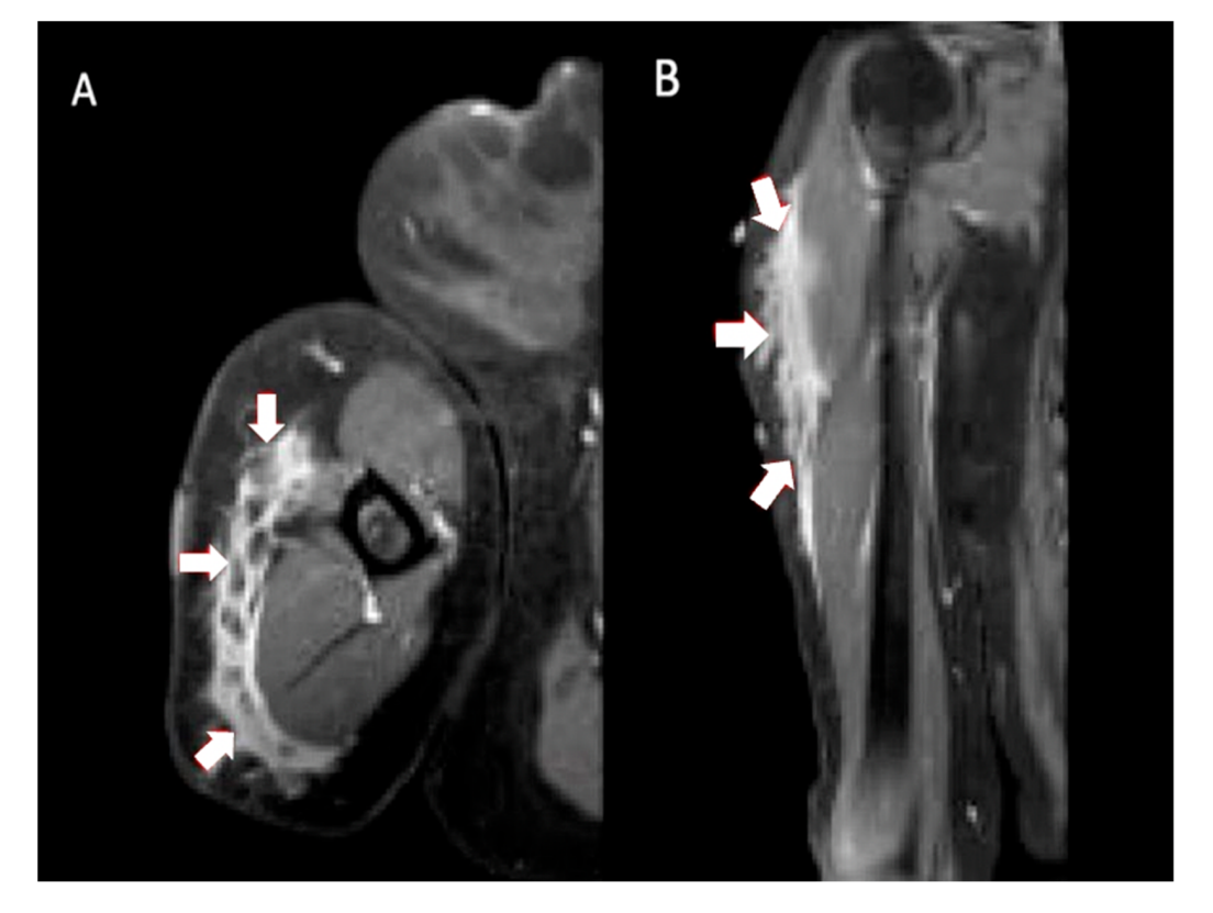
Figure 1. Multiplanar MRI of right shoulder taken 8 months after vaccine administration in right shoulder. Axial T2 ( A ) and coronal T2 ( B ) images show ill-defined fluid signal surrounding interspersed areas of fat. The involved area extended from surgical neck of the humerus to distal diaphysis, measuring approximately 14.9 \times 8.2 \times 1.8 cm (arrows).

*, Abnormal values; WBC, white blood count; RBC, red blood count; Hgb, hemoglobin; HCT, hematocrit; MCV, mean corpuscular volume; MCH, mean corpuscular hemoglobin; MCHC, mean corpuscular hemoglobin concentration; RDW, red cell distribution width; PLT, platelet count; Neut, neutrophils; Lym, lymphocytes; Mono, monocytes; Eos, eosinophils; Baso, basophils; IG, immature granulocyte; NRBCs, nucleated red blood cell; ERS, erythrocyte sedimentation rate; CRP, c-reactive Protein; g/dL, grams/deciliter; fL, femtoliters; pg, picograms; mm/h, millimeters/hour; mg/L, milligrams/liter.