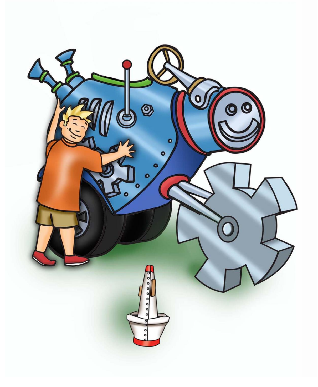
Picture 8. (Big Brother hugging item 1 with foil item in background.) Narrator: "My _____ is shiny. I like my _____," said Big Brother.