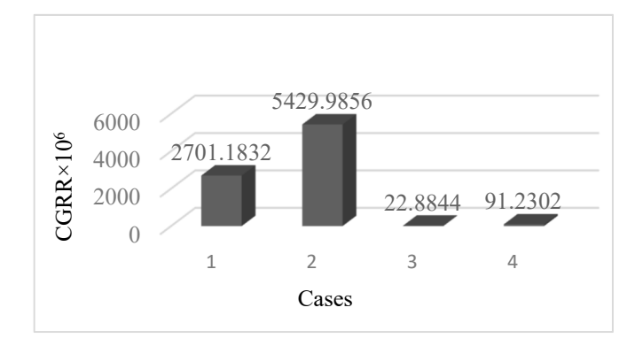
Figure 2. CGRR evaluation considering different ramp rates and failure rates.

from case 1 to Case 2. The CGRR increases over four times when the failure rate is doubled from Case 3 to Case 4. Figure 2 shows that the CGRR is highly sensitive to the ramp rate of a committed unit that carries an operating reserve. It can be seen that the CGRR was reduced more than 100 times when the ramp rates of the units were doubled from Case 1 to Case 3. It should be noted that the ramp rate of the base load generators that do not carry any spinning reserve have no impact on the risk index. This study illustrates that the impact of these parameters should be evaluated prior to making unit commitment and dispatch decisions.