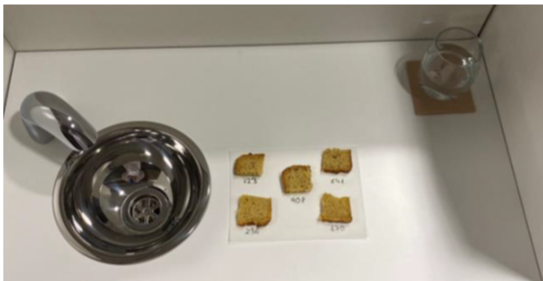
Figure S2. Presentation of the codified gluten-free bread samples for sensory analysis.