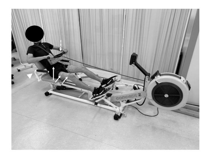
Figure 2. Functional electrical stimulation (FES) rowing machine. A backrest is fixed on the seat (white arrow head). A switch on the handle bar (white dotted arrow) is installed to control the FES (white arrows) timing by the patients themselves.