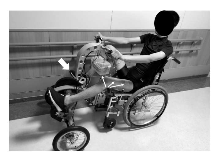
Figure 3. A new functional electrical stimulation (FES) cycling system. The FES cycling system consists of a front-wheel drive unit (thick white arrow) that can be attached to a standard wheelchair and an FES control part (thin white arrows) that enables cycling operation for lower limb paralysis.

Our group has also developed a new FES cycling system that attaches to a standard wheelchair. It consists of a front-wheel-drive unit that attaches to the wheelchair and an FES control unit that enables cycling movements in those with lower-limb paralysis. FES stimulation output is performed by a controller that coordinates the contraction of the quadriceps femoris and hamstring with the paralyzed muscles of the lower limbs from the crank angle during cycling (Figure 3). We are currently verifying the effect of the system on lower limb muscle and bone health in patients with paraplegia due to SCI.