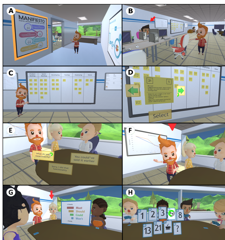
Figure 1. (A) The SM explaining the Agile manifesto. (B) The user meeting the developers. (C) The SM explaining the Kanban board. (D) The user selecting a user story based on its estimation and priority. (E) The user discussing a topic with the SM and the PO. (F) The SM explaining the Sprint performance through a Burndown chart. (G) The PO explaining the MSCW technique to prioritize user stories. (H) The user participating in Poker Planning.

by the SM and the lighting of the objects, as depicted in Figure 1A. After the explanations, the SM offers the possibility to repeat them to reinforce the concepts if necessary. When the foundation of Agile and Scrum is established, the SM asks the user to enter the office to meet his/her colleagues, a question that can be answered through an interactive diegetic button. Once inside the office, the developers are introduced to the user. The majority are programming on their workstations, but some of them are chatting and having coffee on the office couch (see Figure 1B). Following the presentation, the SM proceeds to explain the operation of the Kanban board and the software development life cycle, as shown in Figure 1C. The speech is dynamized through interactions and curious facts (e.g., the SM asks the user if he/she wants to know the origin of the word Kanban, which is Japanese and means something like “card you can see”). Once again, the audio explanations are supported by visuals and guided by the movements of the SM and object lighting (See Supplementary Materials for clarity).