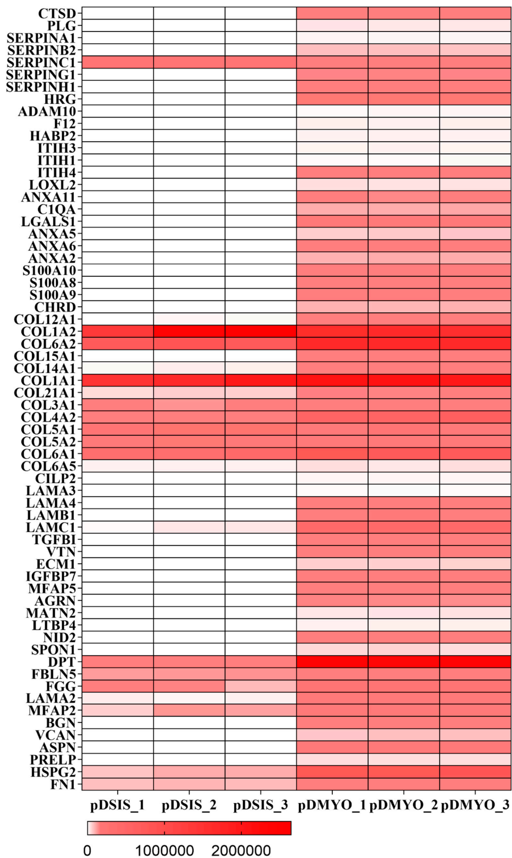
Figure S3 the relative abundance of proteins in pDMYO and pDSIS