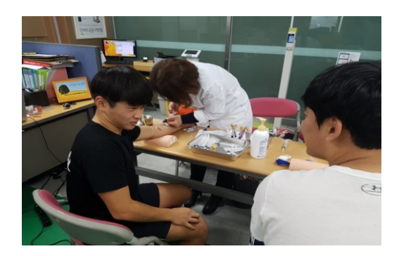
Figure 3. Blood test.

Blood samples (10 mL each) were collected from the subjects' upper veins and were centrifuged at 3000 rpm for 5 min and stored at -70 °C until analysis. The samples were collected by the Clinical Pathology Department of the E Medical Foundation (Seoul, Korea), and the fatigue parameters and muscle damage enzymes were analyzed. The fatigue parameters included lactate, ammonia, glucose, and LDH. The muscle damage enzymes included CK and aspartate aminotransferase (AST).