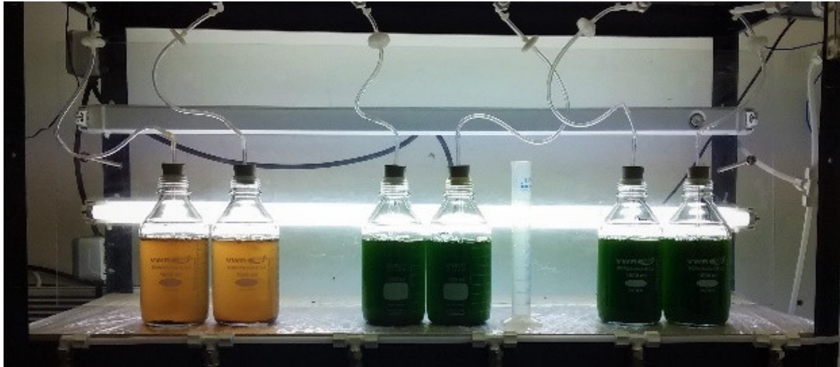
Figure 1. Cultivation of Monoraphidium sp. in batch at different concentrations, from left to right 1:20, 1:30, 1:50 respectively.