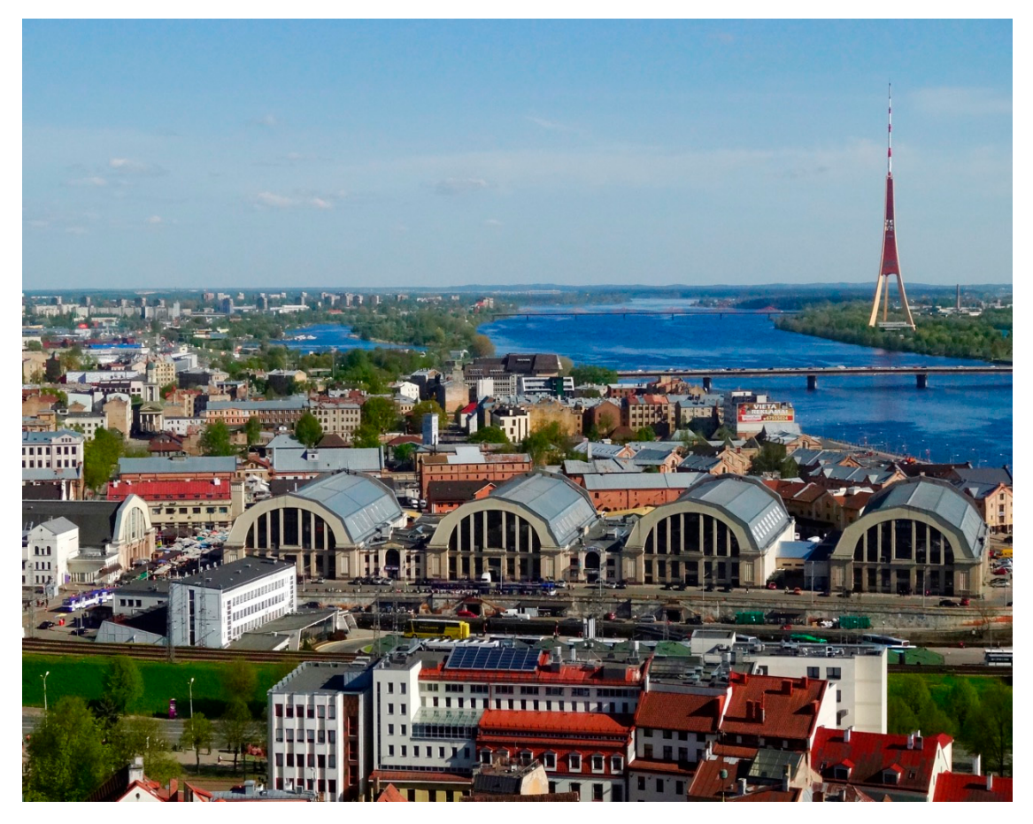
Figure 3. "Riga Central Market is one of the city's most recognizable structures" (Jay Way Travel 2016, p. 1).

Meanwhile, it appears that the majority of interviewees believe that to make RCM more attractive to tourists it would be crucial to create an iconic image for the market. This would mean a picture or illustration that would represent RCM in the midst of Riga as shown in Figure 3.