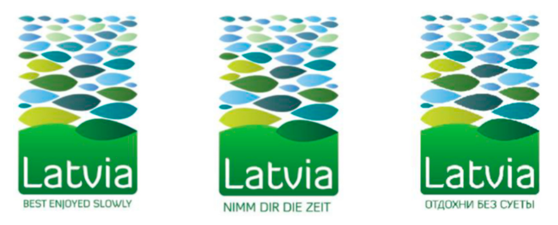
Figure 2. "Latvian tourist brand and slogan in English, German, and Russian" (Serdane 2017, p. 7).

While the literature on slow tourism is still evolving, Latvia with its present tourism marketing brand "Latvia: Best enjoyed slowly" (see Figure 2) is officially promoted as an appropriate destination for slow tourism and is currently the only destination that has applied the slow philosophy in destination marketing at a national level, making the setting of the research unique (Serdane 2017). The new tourism brand claims to follow these principles since the "basic values of the Latvia tourism brand are characterized by truthfulness, profoundness, easiness and confidence grounded in the Latvian environment, culture and people" (Serdane 2017; Latvian Tourism Development Agency 2010, p. 15).