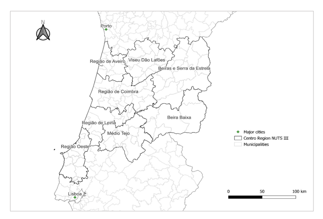
Figure 1. Centro de Portugal Region and its 8 Subregions or NUTS III.

largest surf wave with 24 to 30 m. Moreover, the Region is gifted with 17 parks/reserves and protected landscapes, of which the forest of Buçaco stands out, with exceptional natural areas. It presents a very strong cultural heritage with 189 monuments and 4 UNESCO World Heritage Sites, namely the Monasteries of Alcobaça and Batalha, the Convent of Christ in Tomar and the University of Coimbra, and 5 cities that were included by UNESCO in the Creative Cities Network. The Region is marked by unique places such as the Historical Villages, Schist Villages, medieval castles, and whitewashed houses (Óbidos), and cities, such as Coimbra, known for being the city of students and scholars, Aveiro, between the estuary and the sea, and Viseu, Guarda, and Castelo Branco, where the stone architecture maintains its original features. Finally, the gastronomy and the wines from the demarcated regions are also highly popular.