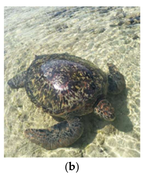
Figure 2. A small island, Xiaoliuqiu, become an important destination during COVID-19. ( a ) Vase Rock, a very popular attraction where tourists visited and snorkeled; and ( b ) Sea turtle, which could be seen closely during early mornings. All the photos showed the students not only as tourists but also as ecological learners when they observed the landscape without affecting the sea wildlife.