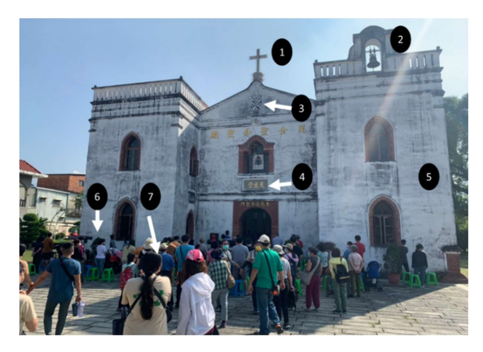
Figure 1. A photographic analysis for sustainability learning within societal transformation through individual experiences.

presentations. An example is shown in Figure 1. The analyzed photograph was taken in Pingtung County, southern Taiwan. The Wanjin Basilica, built over 160 years ago (in 1861), is currently the oldest Catholic church in Taiwan. The photograph was explained and analyzed using the embedded numbers.