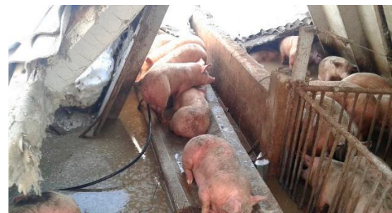
Figure 1. Cont.