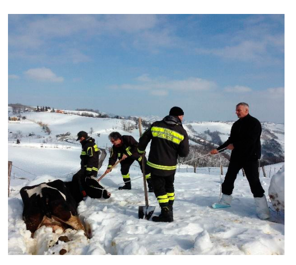
Figure 1. Collapsed sheds in damaged farms in the Province of Teramo and farm animals rescue.

Thousands of livestock animals were trapped under collapsed buildings, injured or killed. The number of livestock farms that reported collapsed or damaged stables in the four provinces of Abruzzo was 282. Most of them (87%) were located in the province of Teramo (Table 1).