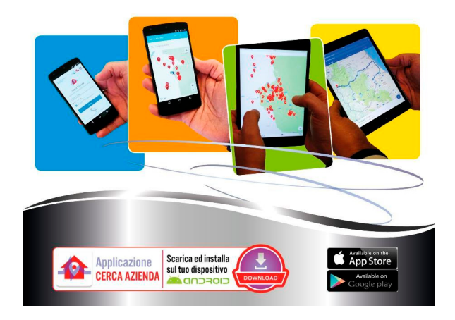
Figure 5. Mobile application called "Search the Farm", Source: Istituto Zooprofilattico Sperimentale dell'Abruzzo e del Molise "G. Caporale".

To date, the availability of seismic damage scenarios remains of critical importance in order to be able to quickly estimate the expected damage as well as the nature of the resources to be allocated for rescue and emergency management. The future challenge will be the development of a new information system for the assessment of non-epidemic emergency scenarios in veterinary public health. For this purpose, the updating of the emergency management system will require a review of the data available on the real vulnerability of companies, such as those on the type of structure and building materials, in relation to the micro-seismic data of the territory, to identify specific risk factors for farms and livestock. This will, in turn, strengthen the response capacity by improving the risk prevention and mitigation phases. This innovative system represents an additional strategic tool at local, regional, and national levels supporting the development and implementation of the LVS non-epidemic emergency management plans, and as such will be made available to the National Civil Protection system. Through a multidisciplinary approach, multidisciplinary professional skills and competencies, specifically dedicated to non-epidemic emergency management, it will be possible to define empirical and analytical models for assessing damage scenarios stemming from data and information obtained by existing veterinary information systems.