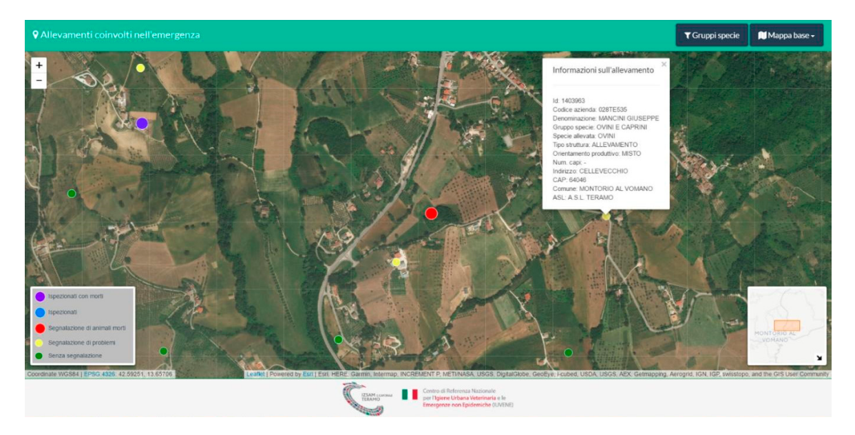
Figure 4. Example of a geolocalized farm for assistance activities.(The assistance operations through livestock feed supply were completed on 2 March, 2017.).