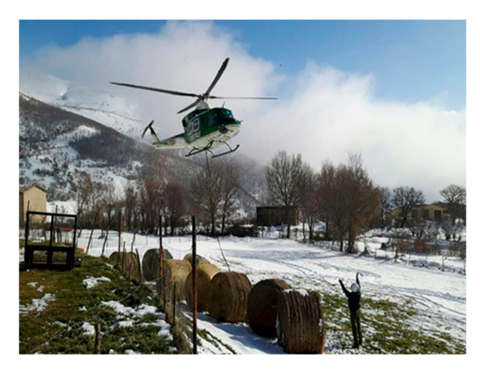
Figure 3. Distribution of farm feed to farms reporting urgent supply needs.