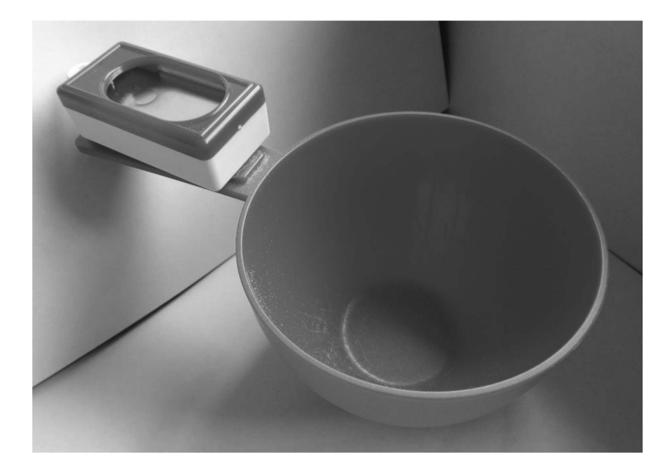
Figure 1. Photo of the plastic cup with clicker taped to the handle used in the clicker training practical classes.

Prior to the first class, and with the chickens having fasted for five hours, the first author (as handler) took each chicken from its cage and into the room. As soon as the chicken was released on to the table, the clicker was pressed by the second author (as trainer). The clicking sound was immediately followed by offering the food to the chicken (with the cup half full to avoid spillage, which would distract and satiate the chicken, thus slowing the rate of training). Several clicks and treats were given, approximately 3–5 s apart. At this stage, the clicker was not pressed to coincide with any specific behavior of the chicken, as the aim was to habituate the chicken to the new surroundings and feeding equipment ( i.e. , the cup being presented by a human hand), and build the association (classical conditioning) between